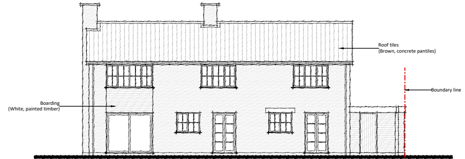
East Elevation as Existing