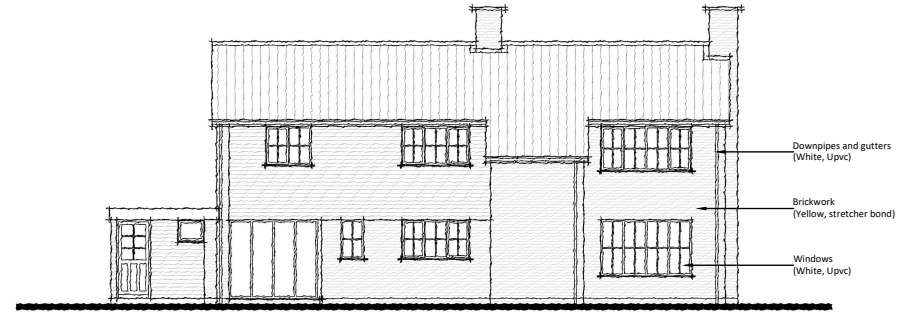
West Elevation as Existing