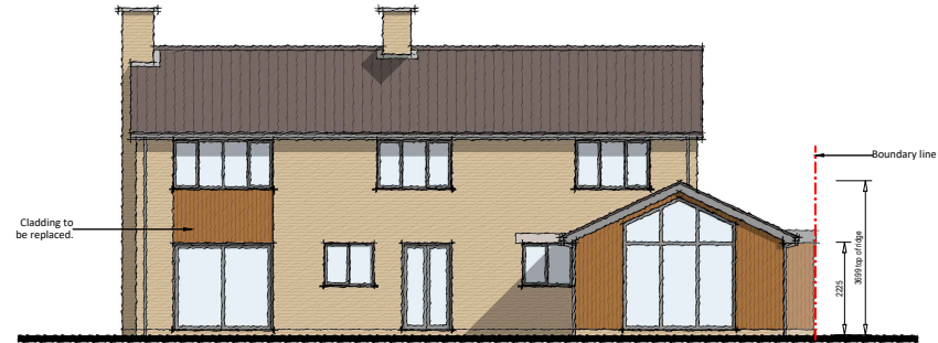
East Elevation as Proposed