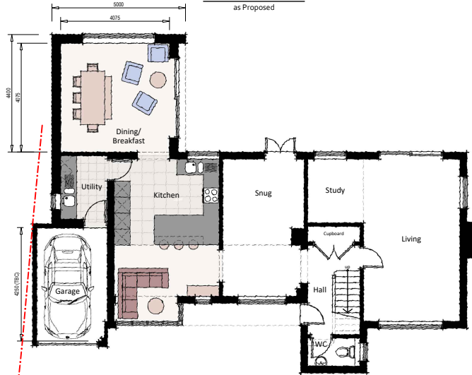
Ground Floor Plan as Proposed