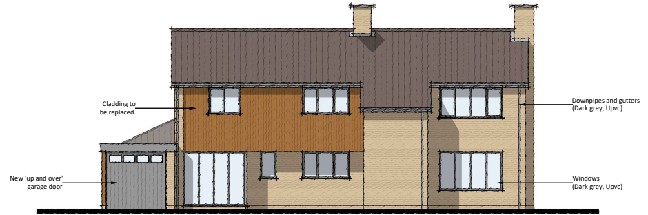
West Elevation as Proposed