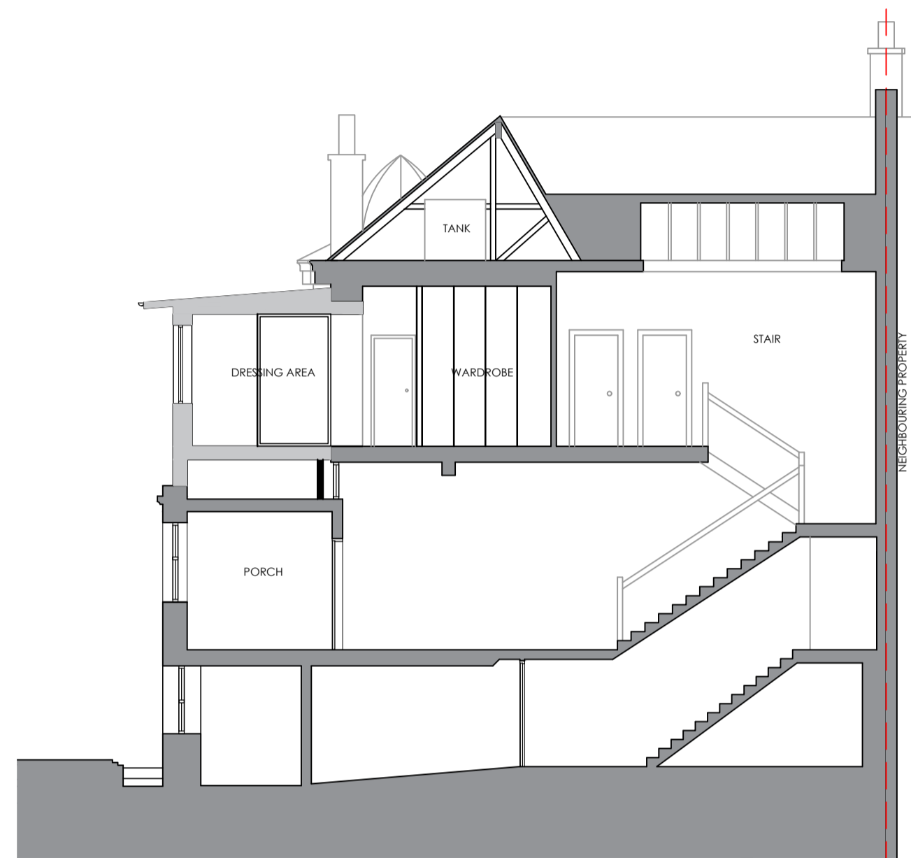
PROPOSED SECTION BB SCALE 1:100@A1