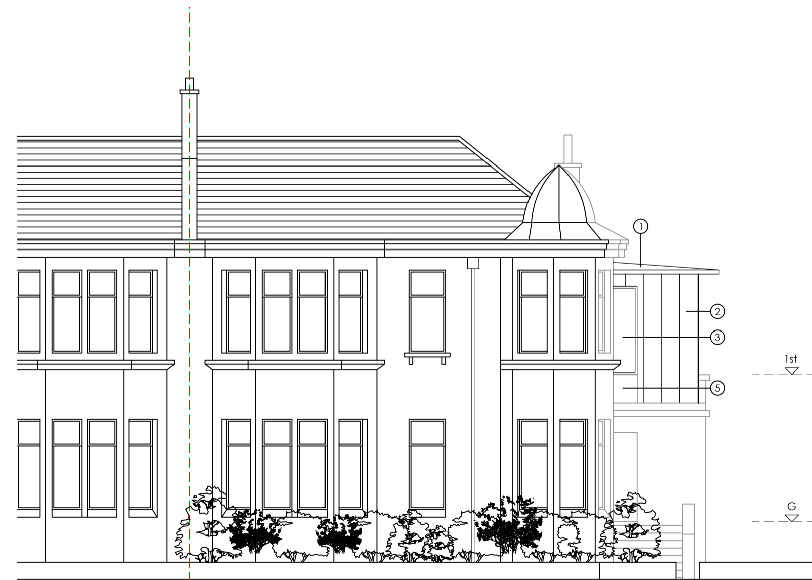
PROPOSED FRONT ELEVATION SCALE 1:100@A1