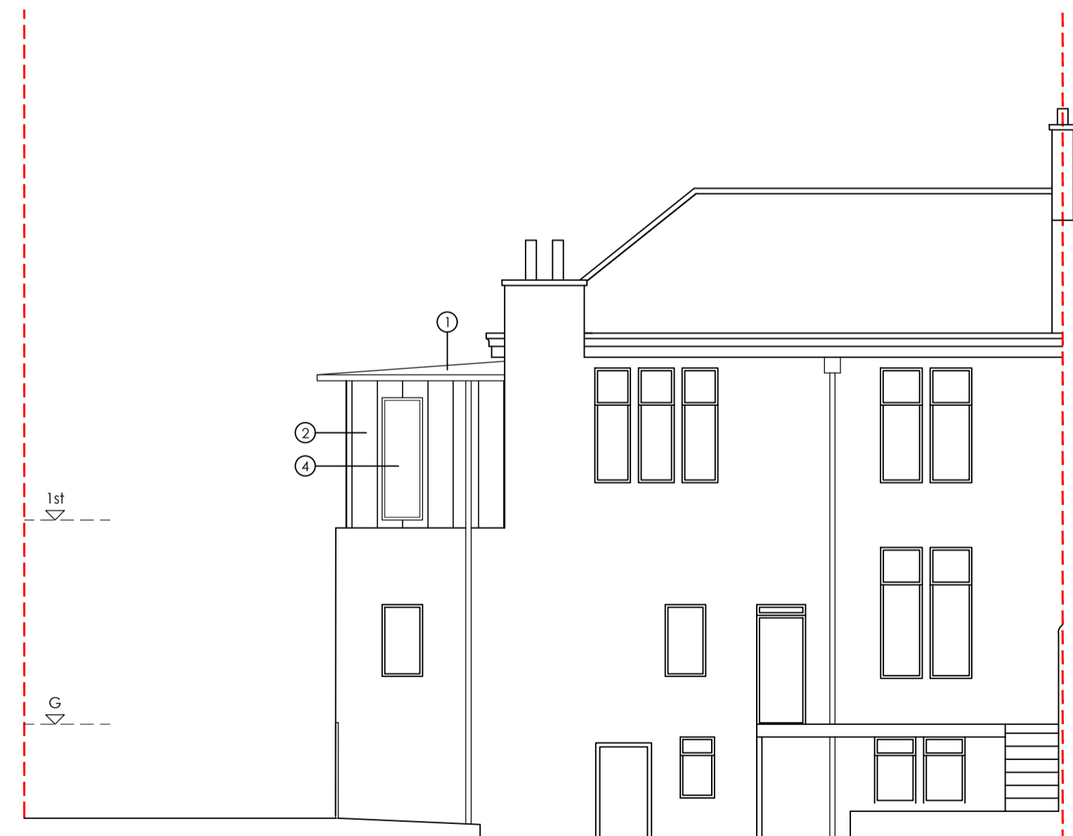
PROPOSED REAR ELEVATION SCALE 1:100@A1