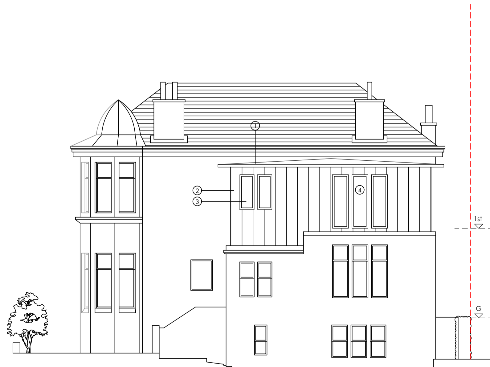
PROPOSED SIDE ELEVATION SCALE 1:100@A1