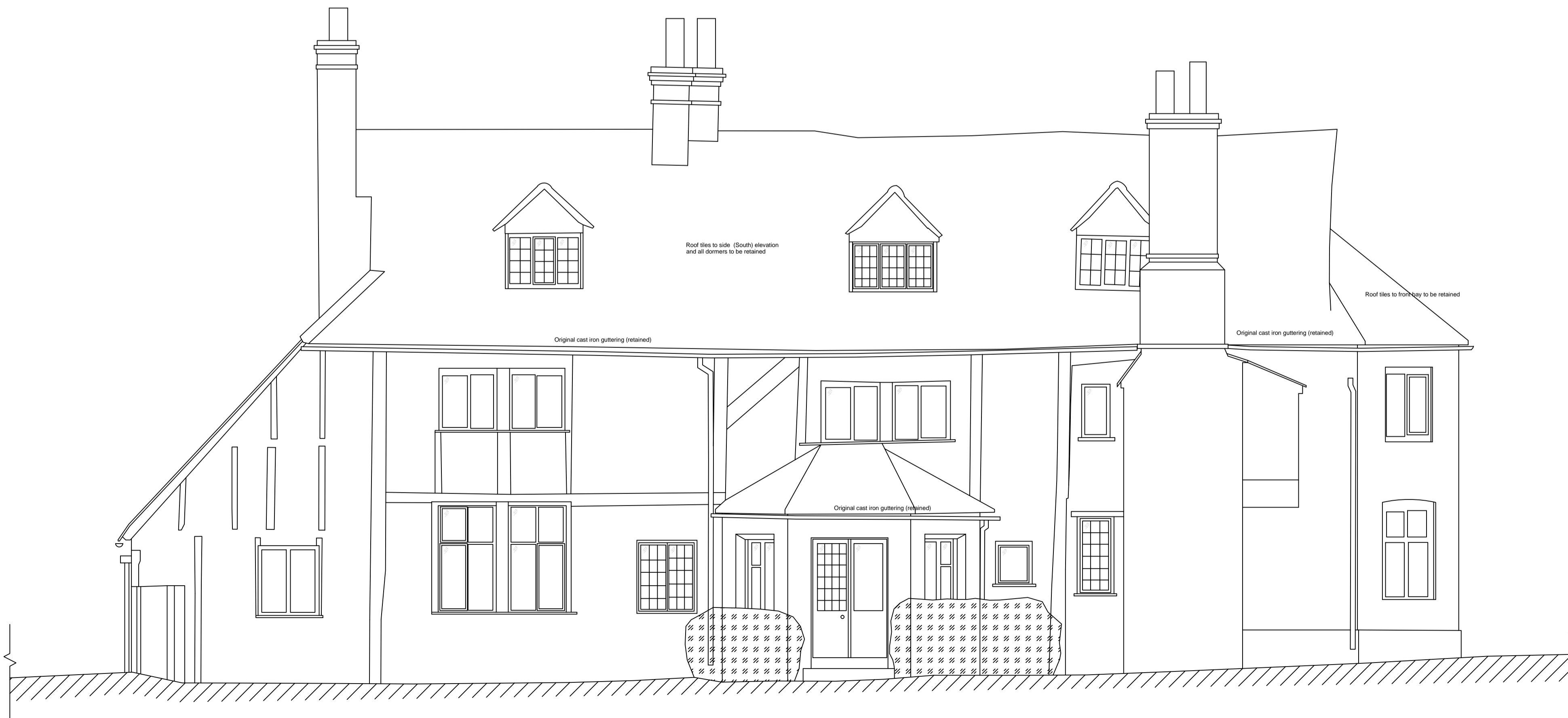
SIDE ELEVATION (South)