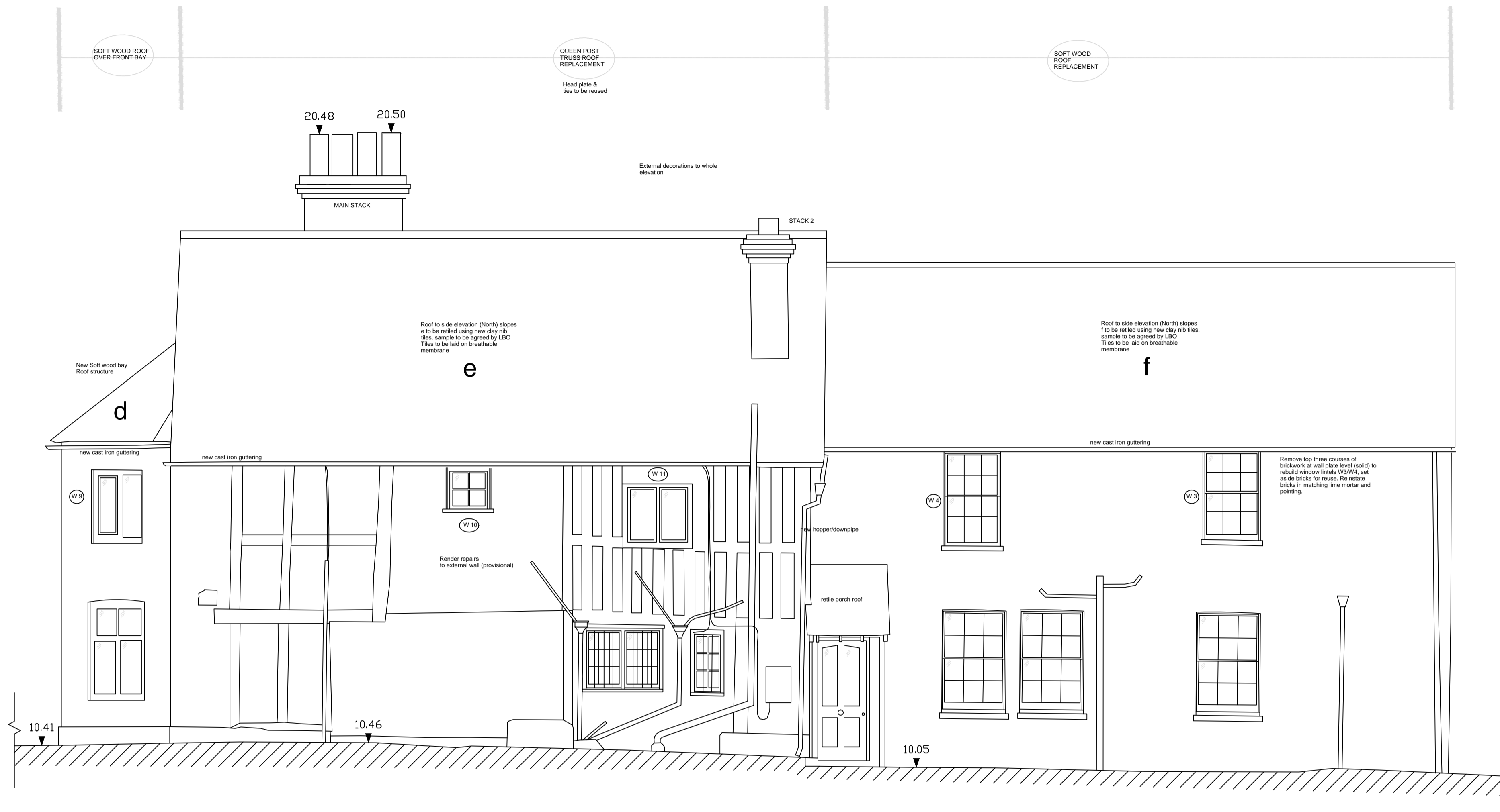
SIDE ELEVATION (North)