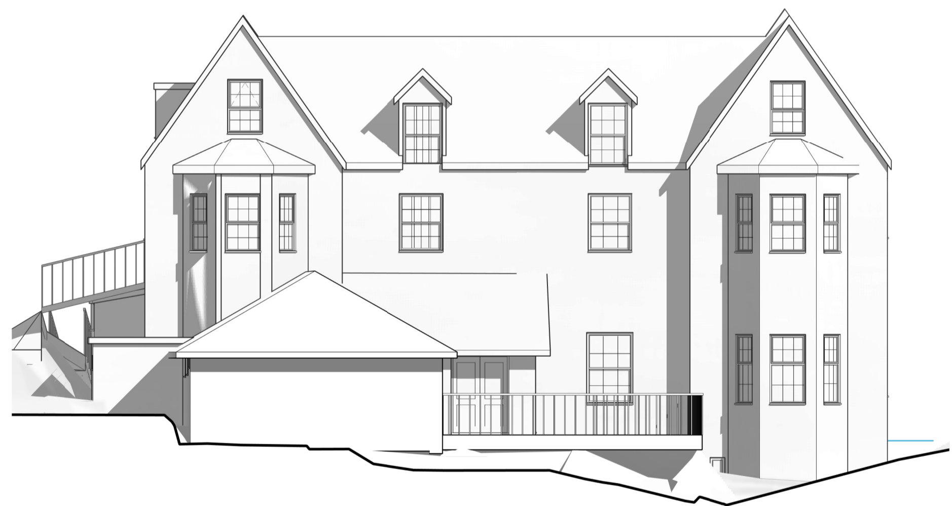
Existing Rear 1 : 100