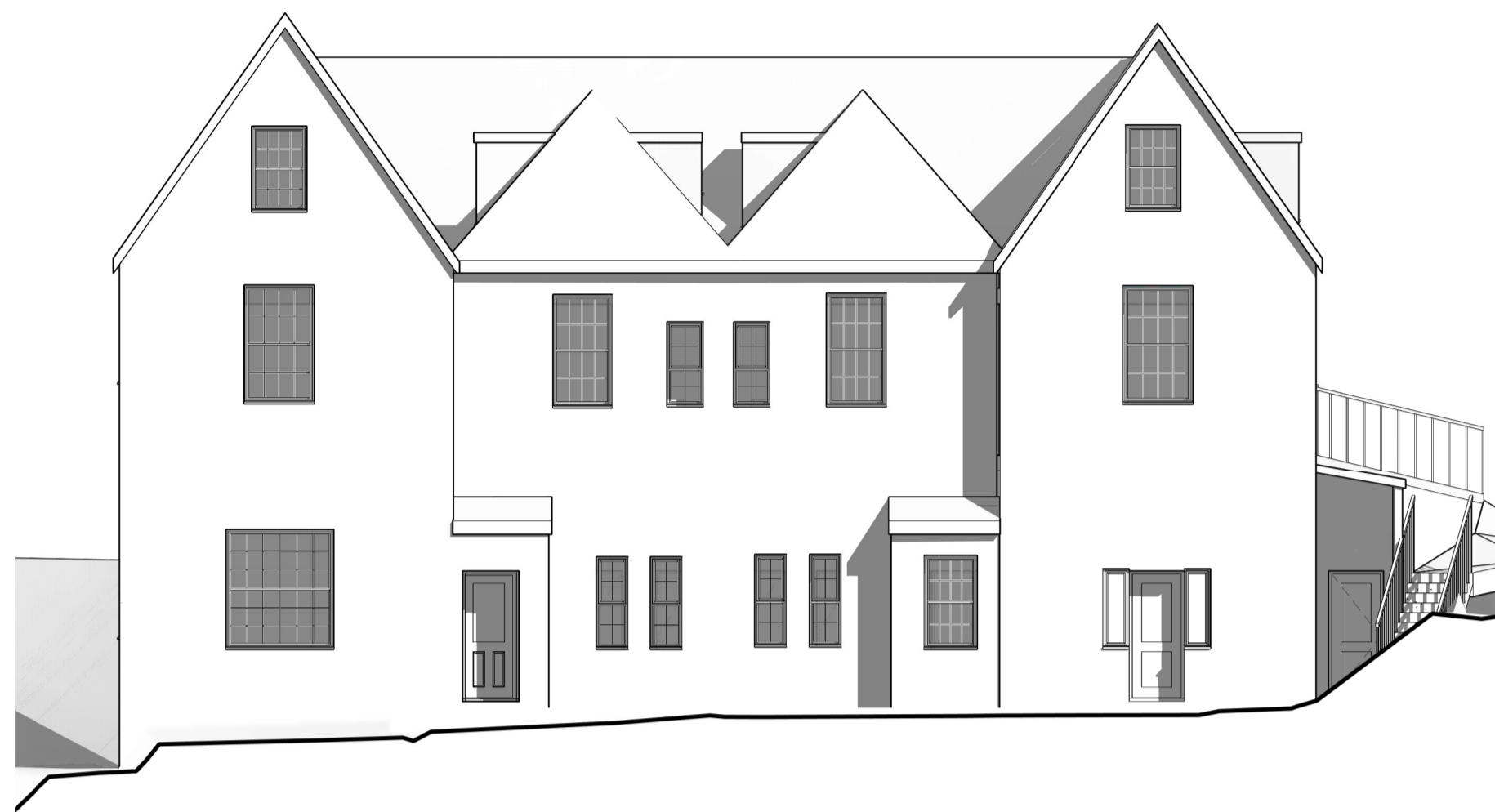
Existing Front 1 : 100