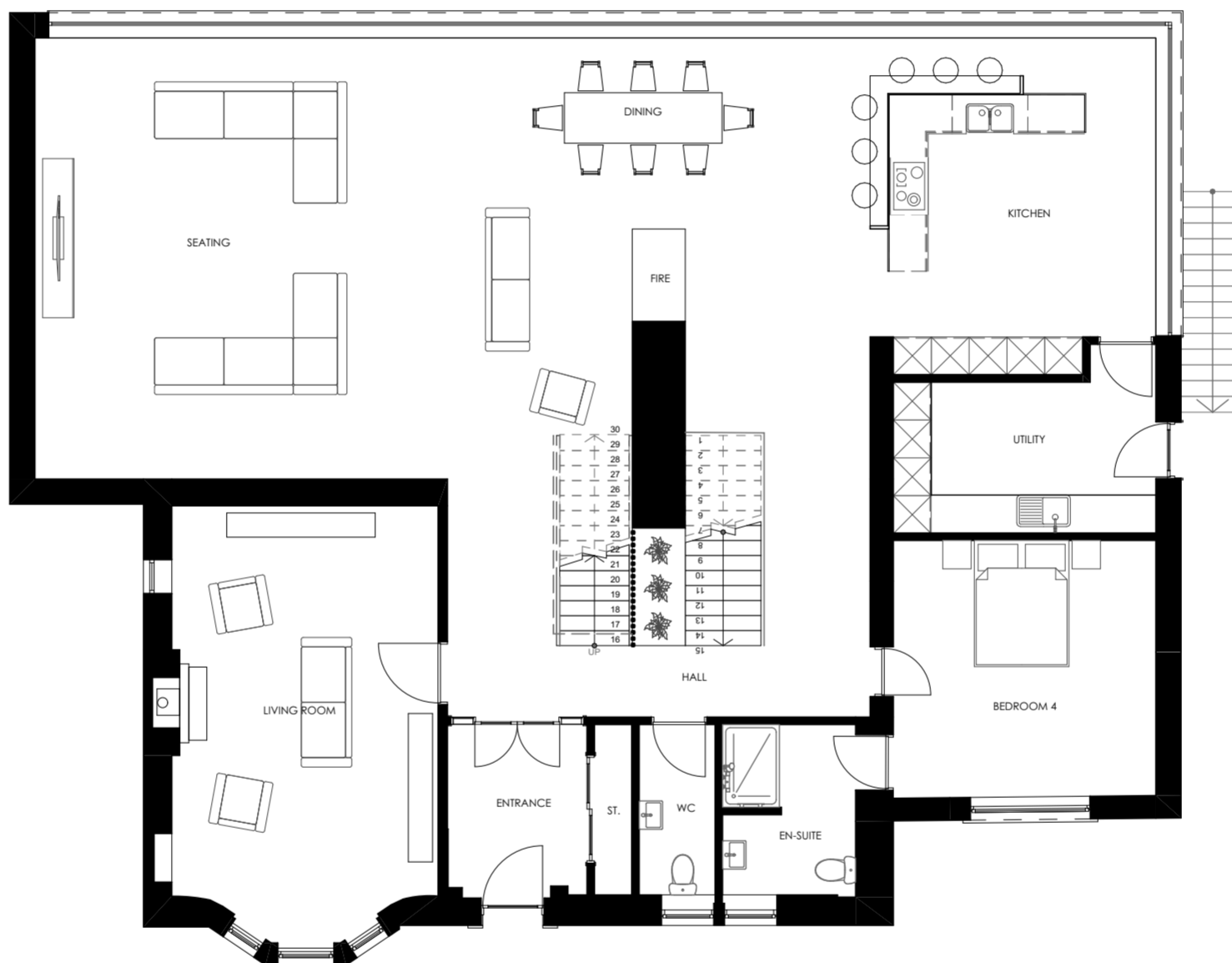
GROUND FLOOR AS PROPOSED SCALES @ 1:100 (A2)