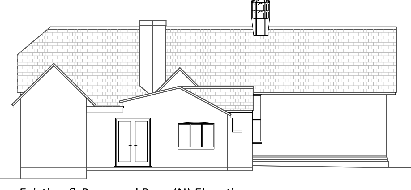
Existing & Proposed Rear (N) Elevation 1:100