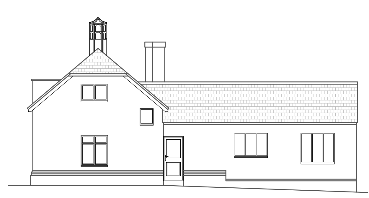
Existing & Proposed Side (E) Elevation 1:100