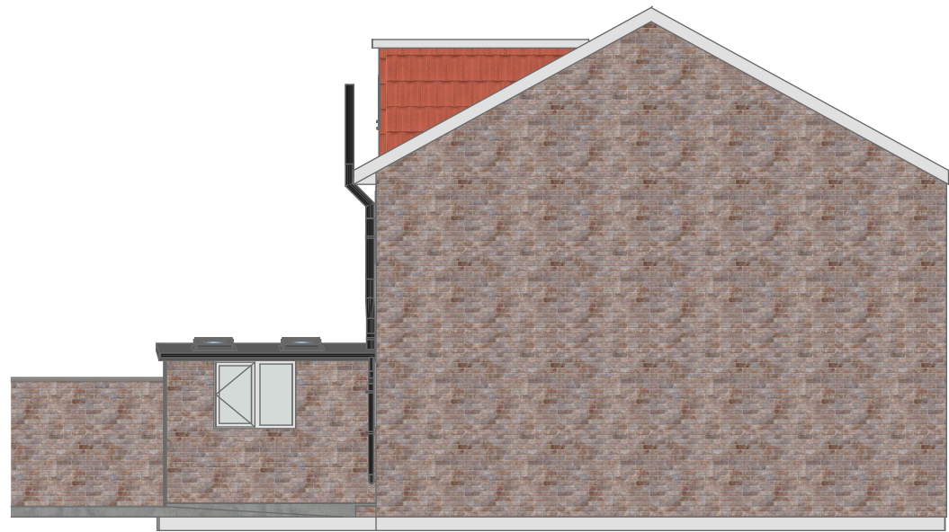
E-01 South West Facing Elevation (1) 1:100