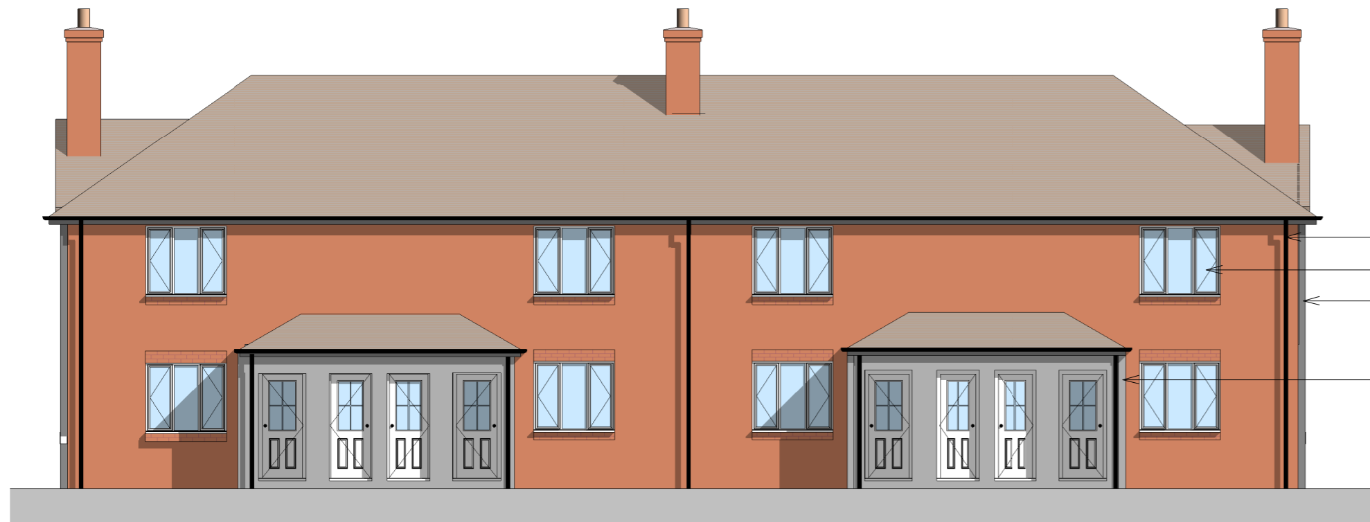
Front Elevation Type 3 1 : 100