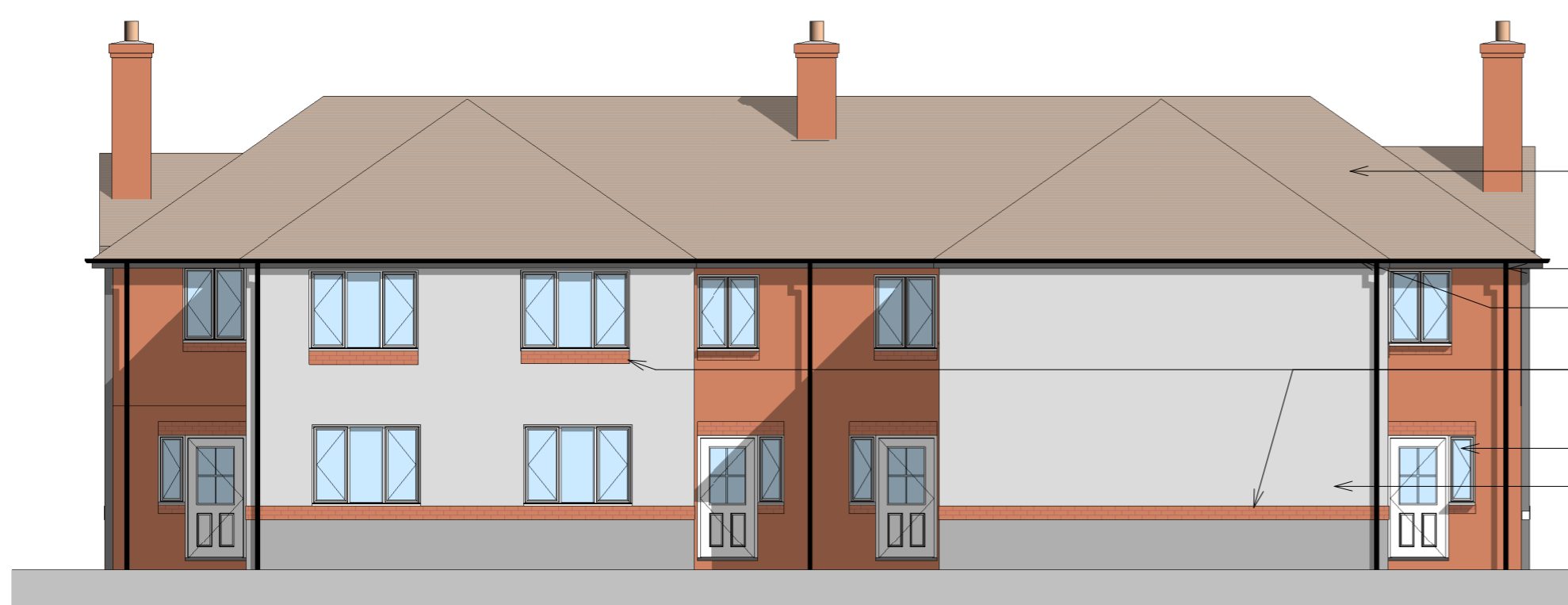
Rear Elevation Type 3 1 : 100