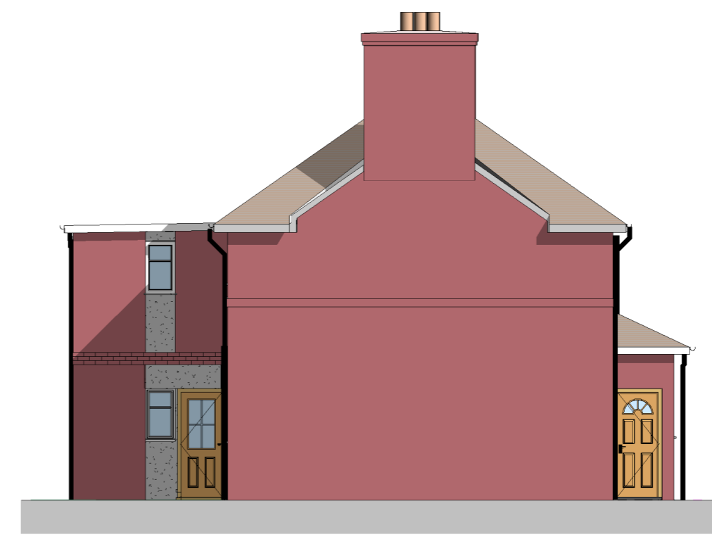
Left Side Elevation Existing 1 : 100