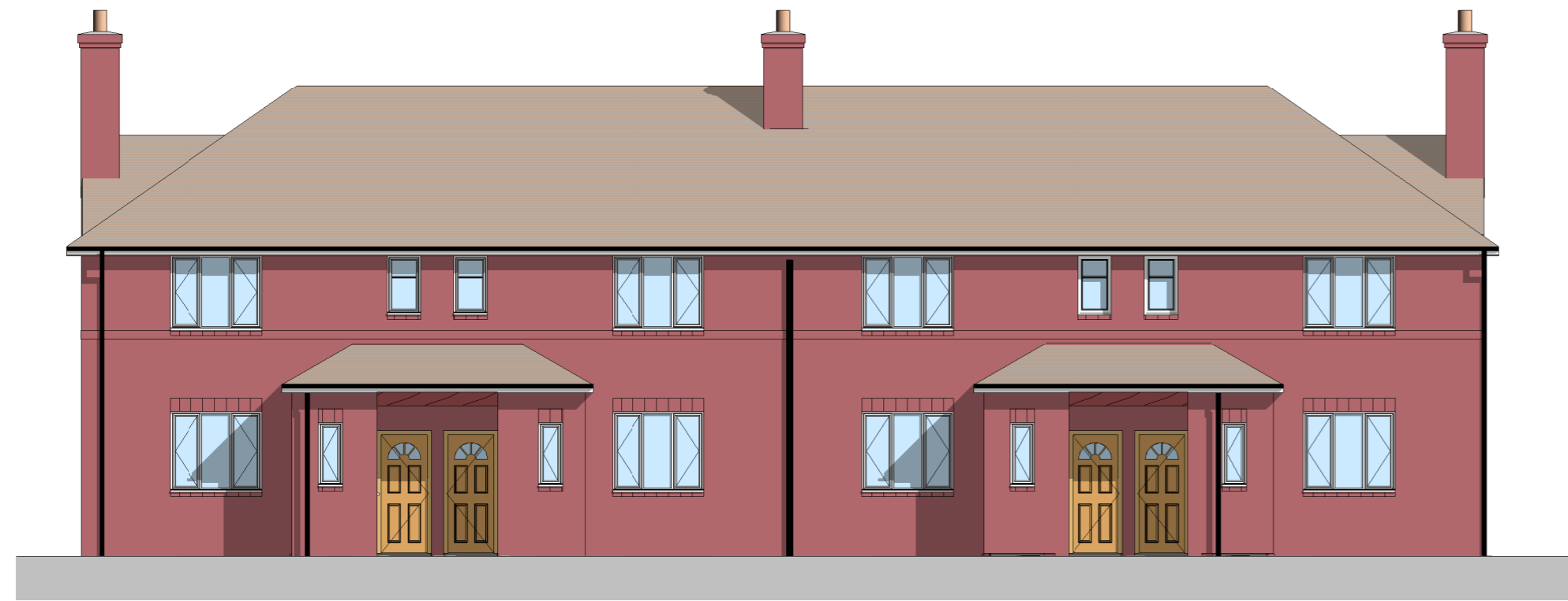
Front Elevation Existing 1 : 100