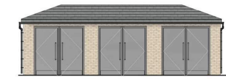
Front Elevation (N) 1 : 100