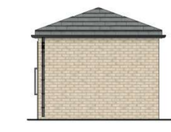
Side Elevation (W) 1 : 100