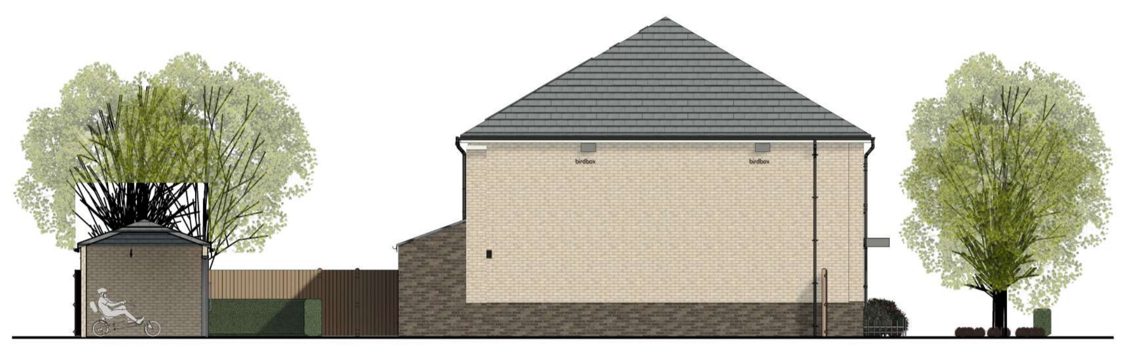
Proposed Side Elevation (E) 1 : 100