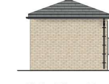
Side Elevation (E) 1 : 100