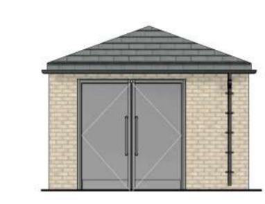
Front Elevation (W) 1 : 100