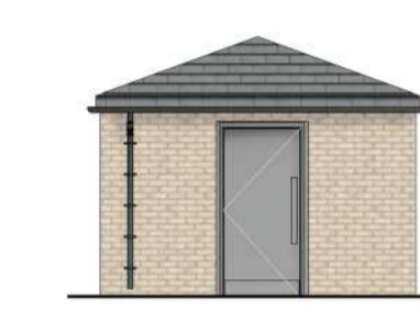
Rear Elevation (E) 1 : 100