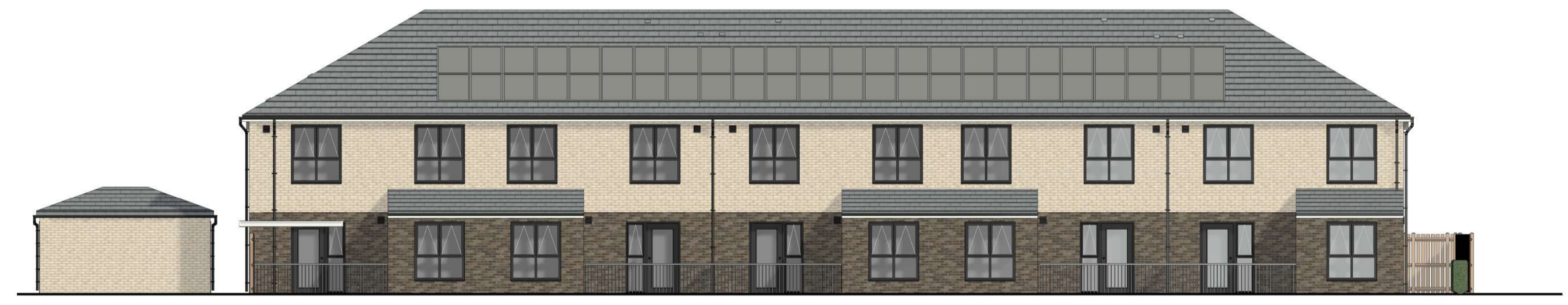
Proposed Rear Elevation (S) 1 : 100