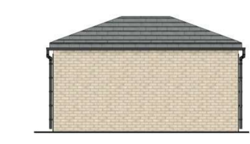
Side Elevation (S) 1 : 100