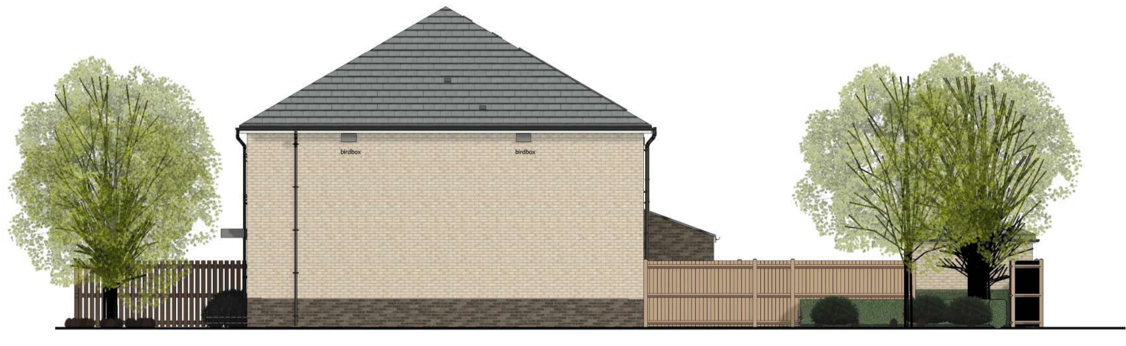
Proposed Side Elevation (W) 1 : 100