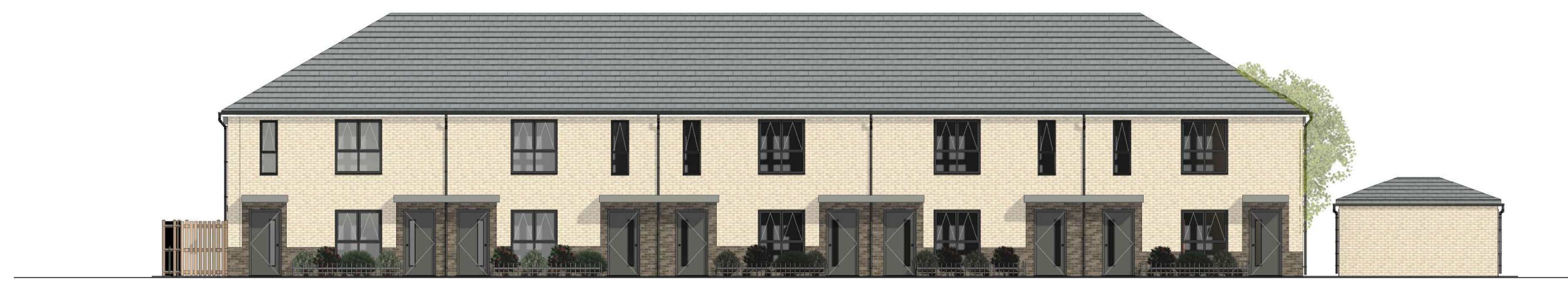
Proposed Front Elevation (N) 1 : 100