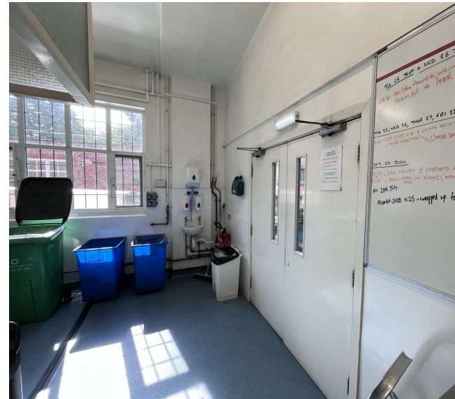
- 03. EXISTING PARTITION BETWEEN KITCHEN AND SERVERY REMOVED