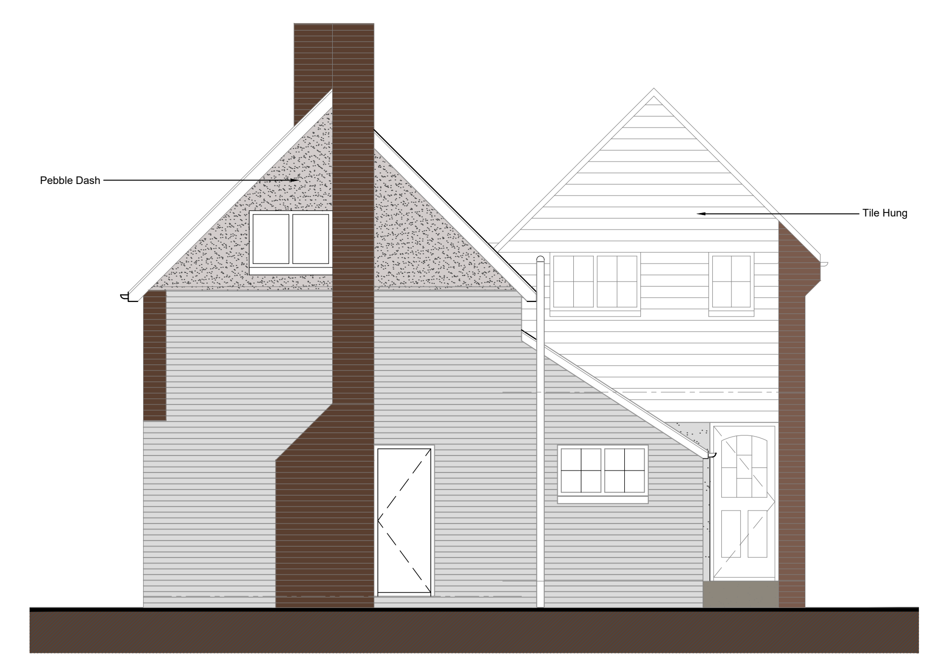
EAST (SIDE) ELEVATION