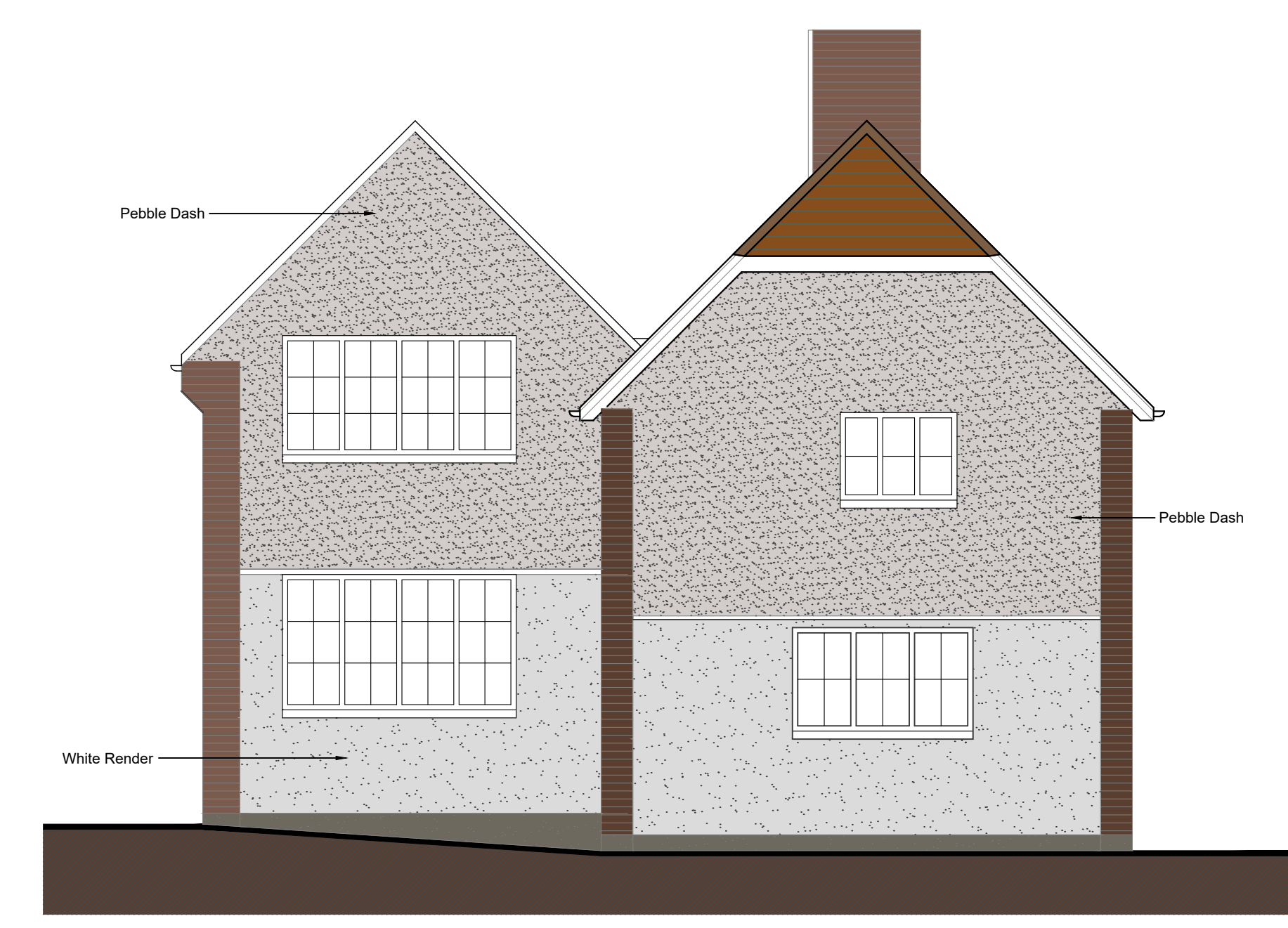
WEST (SIDE) ELEVATION