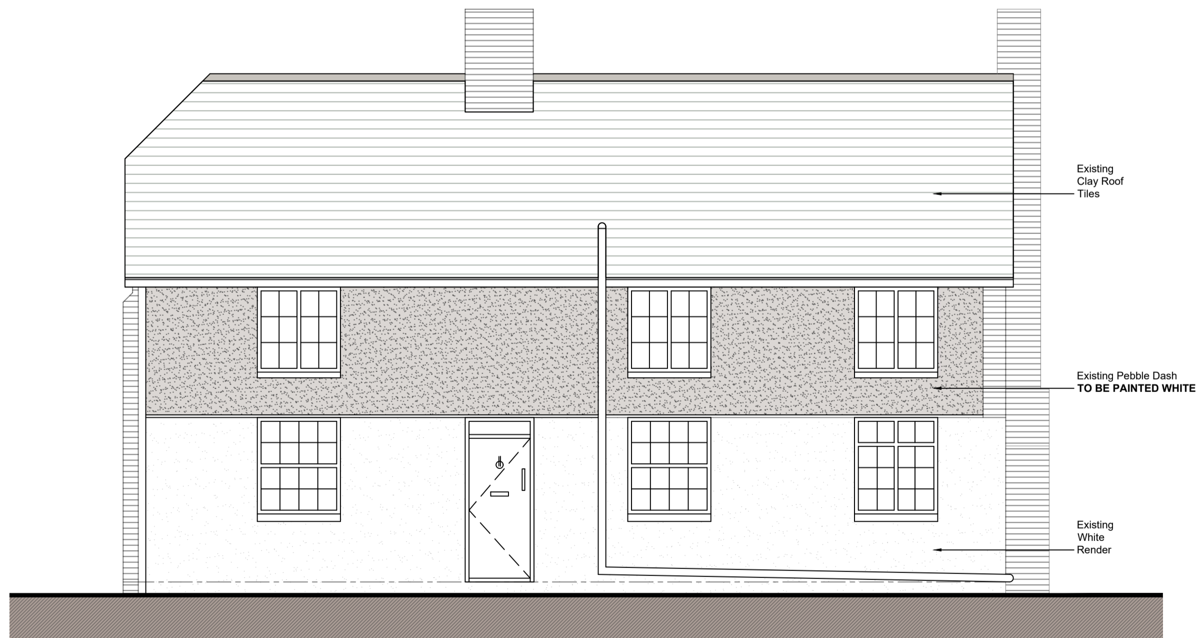
SOUTH (FRONT) ELEVATION