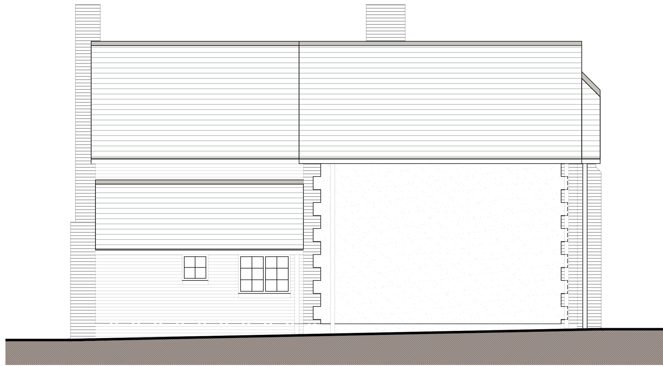
NORTH (REAR) ELEVATION