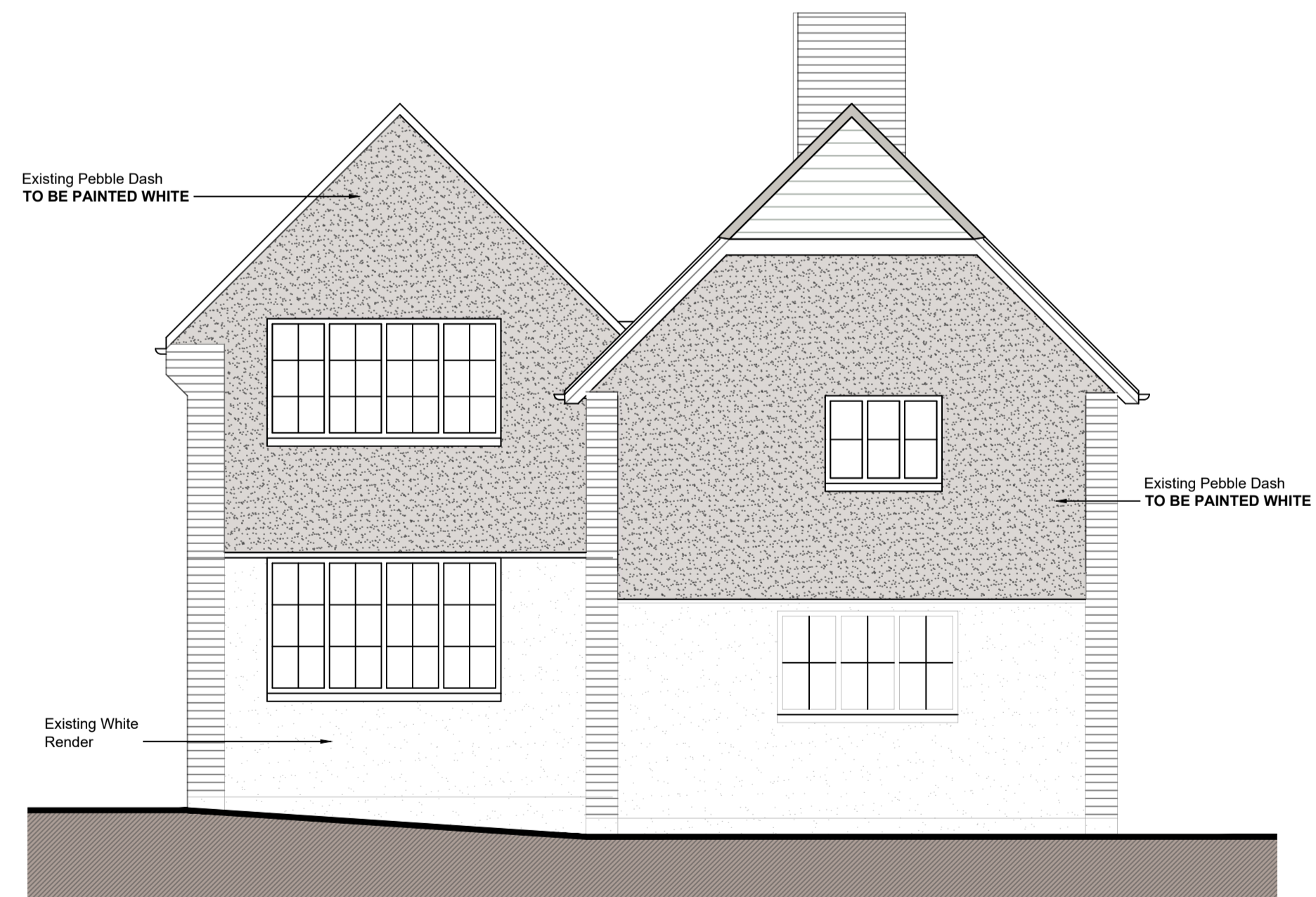
WEST (SIDE) ELEVATION