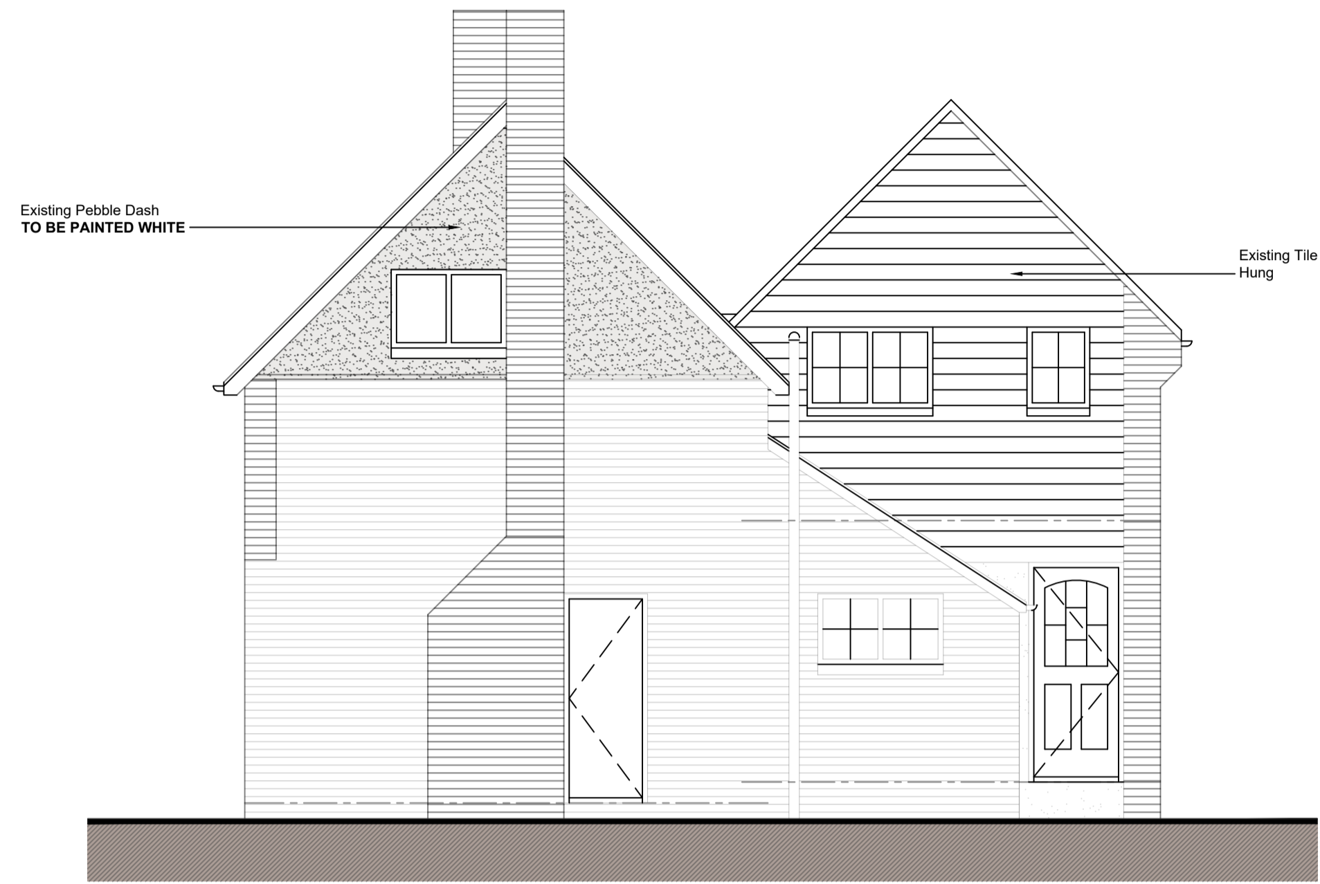
EAST (SIDE) ELEVATION