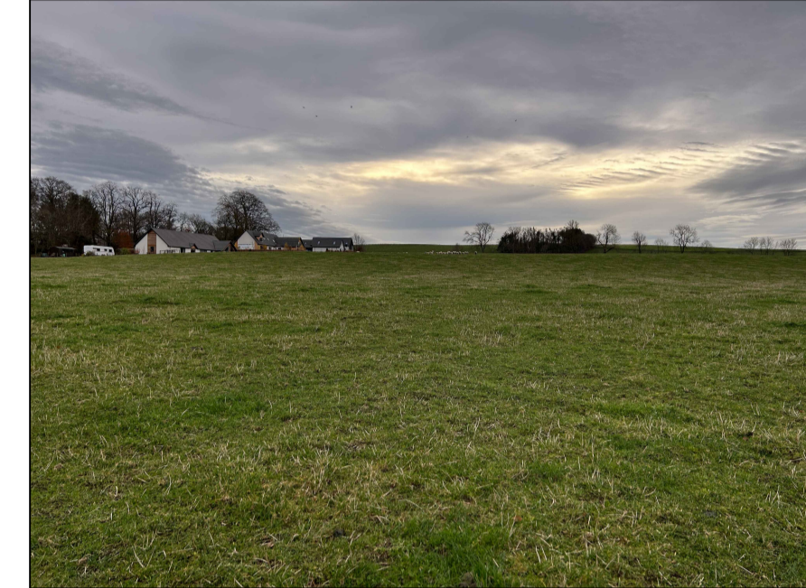
View of Site from North