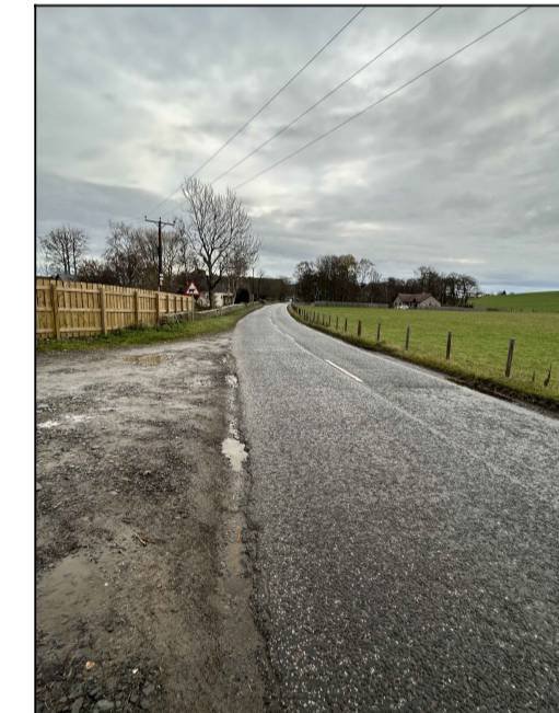
Visibility Splay to the East