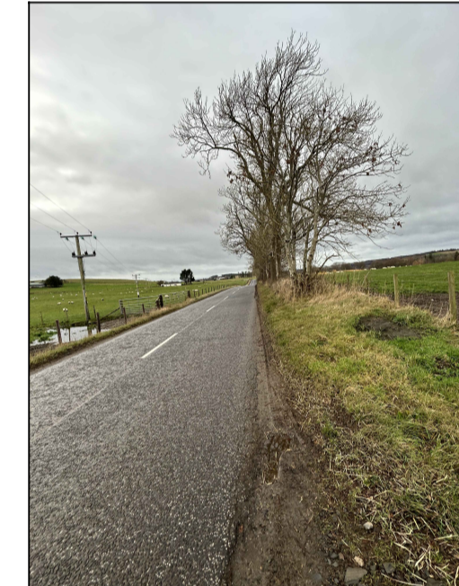
Visibility Splay to the West