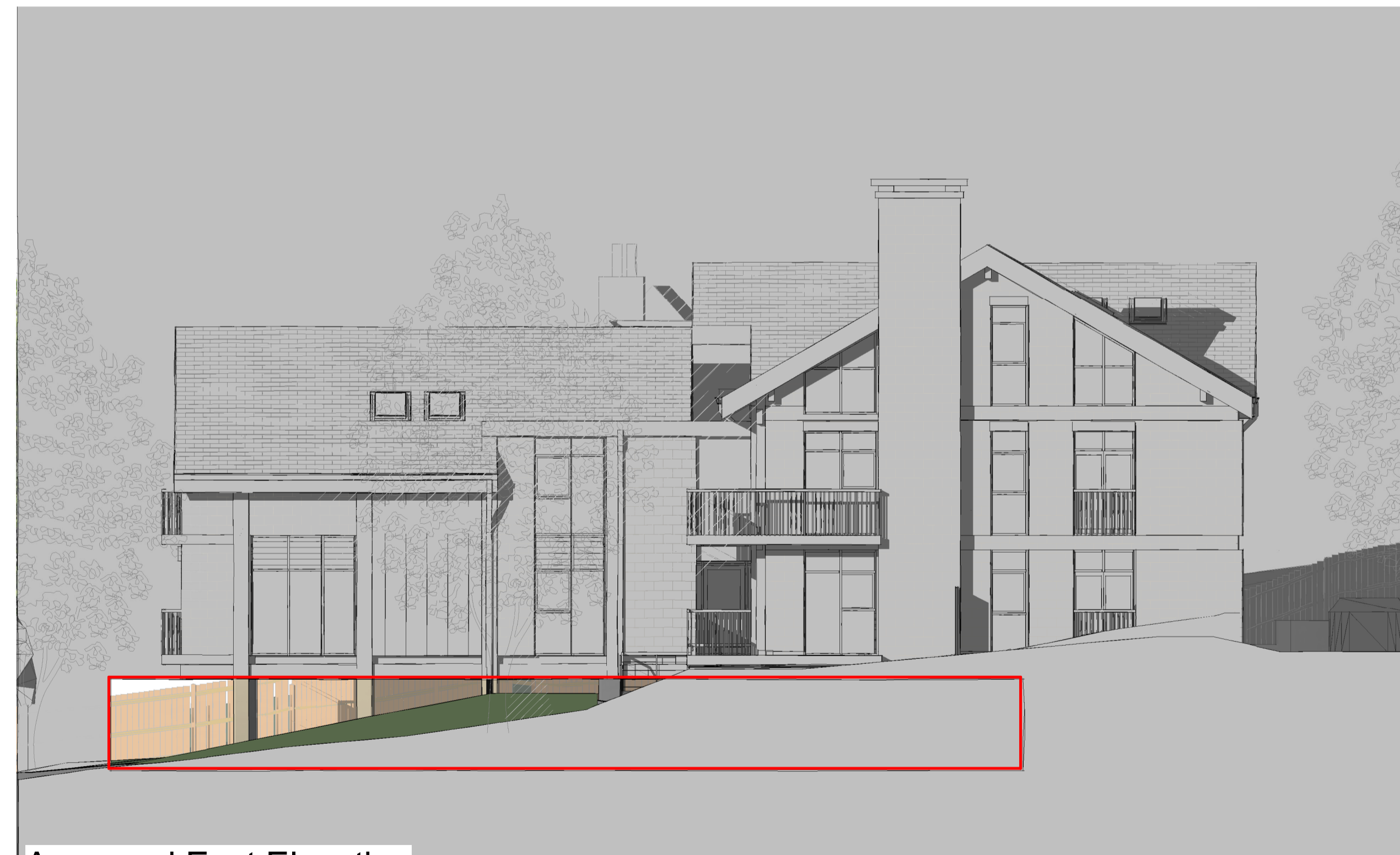
Approved East Elevation 1 : 100

APPROVAL NOTICE 22/04364/FUL Dated 08/08/2023