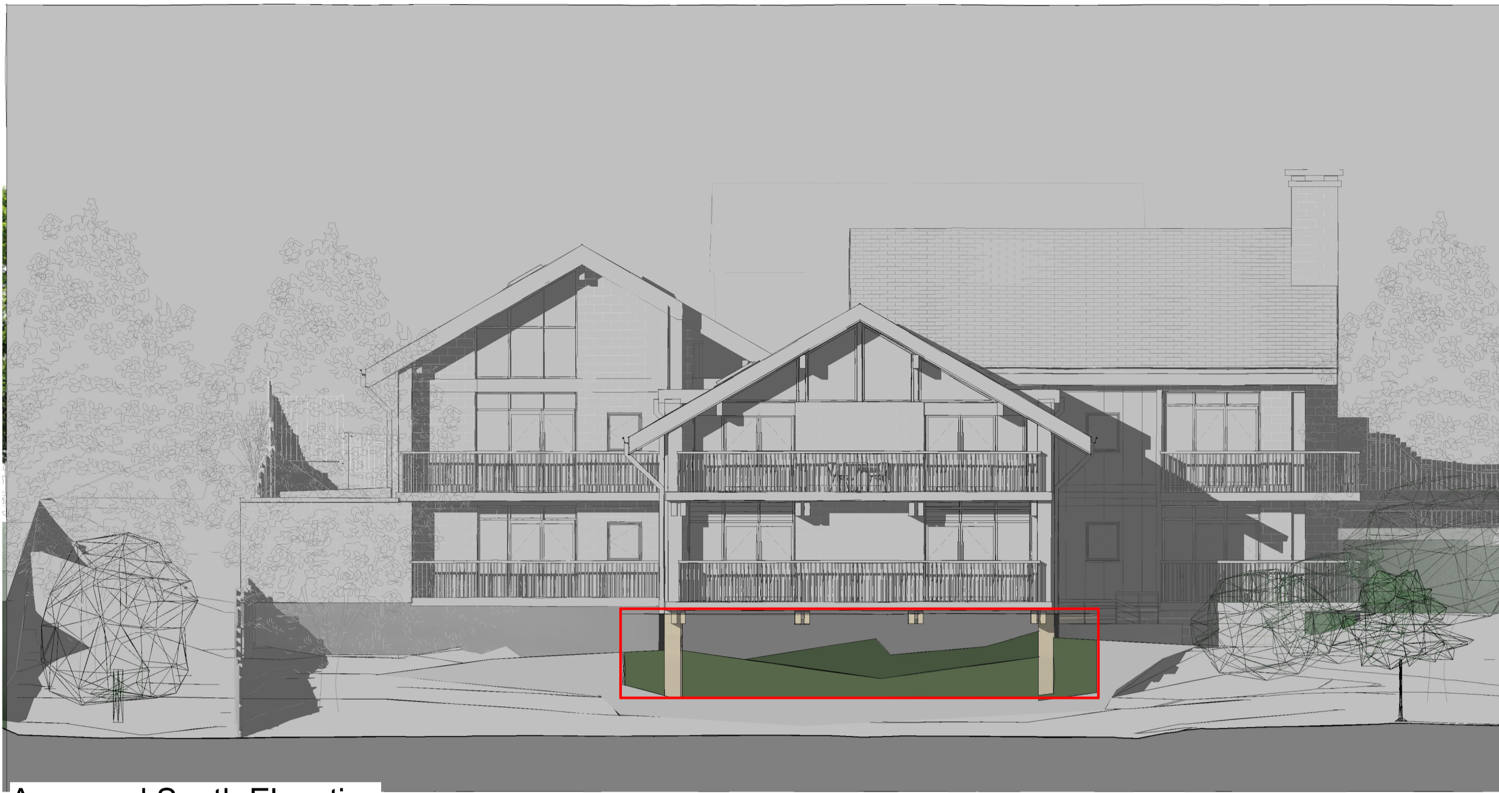
Approved South Elevation 1 : 100