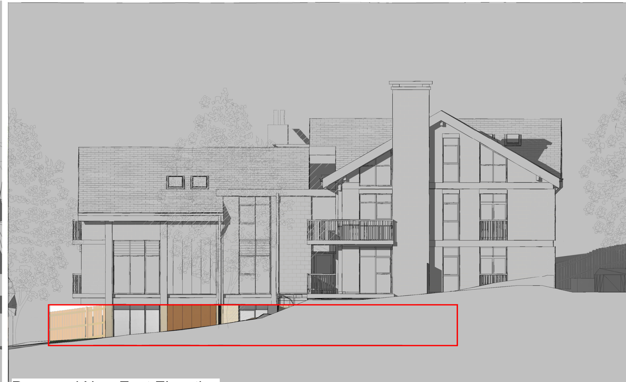
Proposed New East Elevation 1 : 100