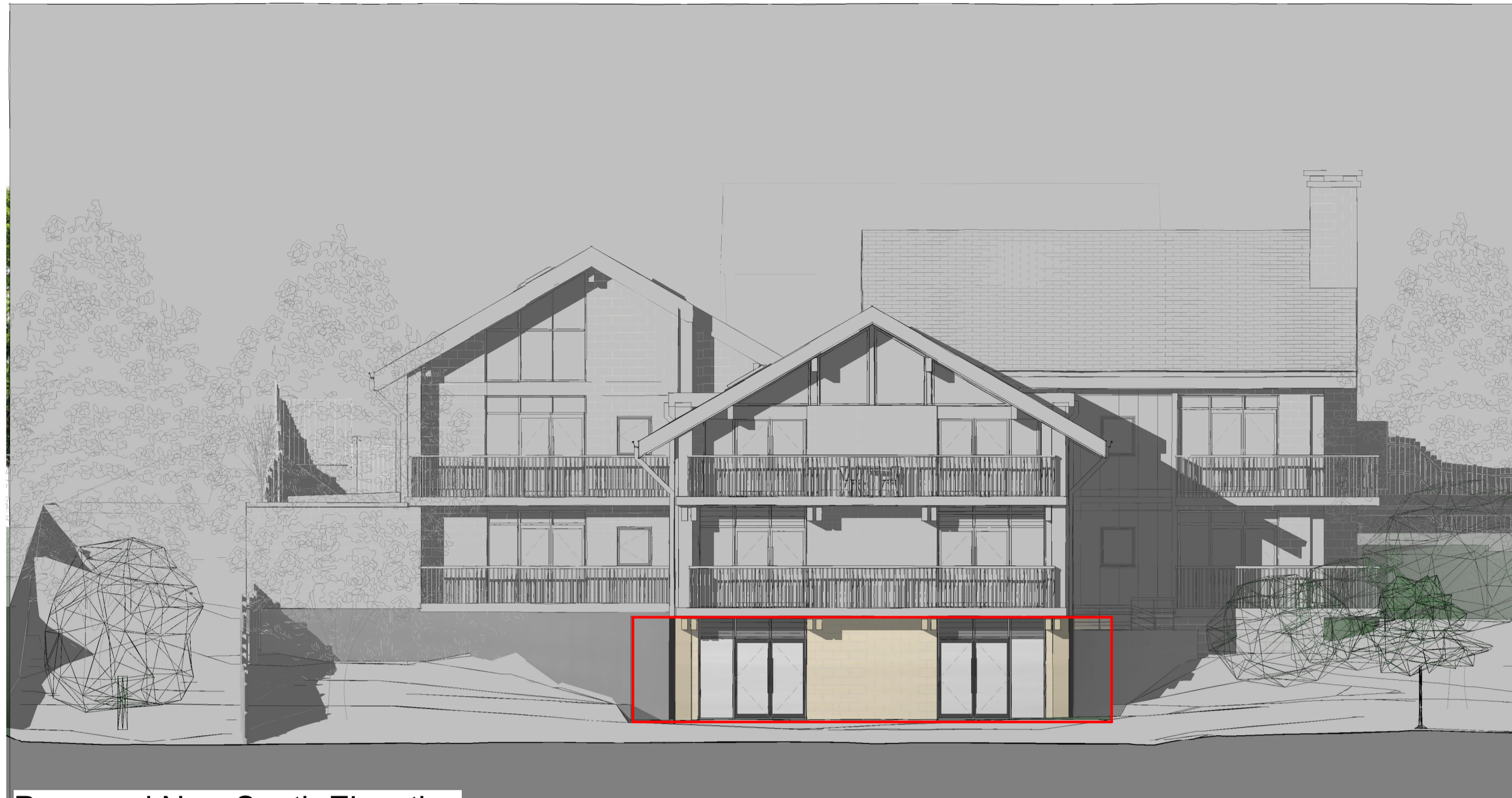
Proposed New South Elevation 1 : 100