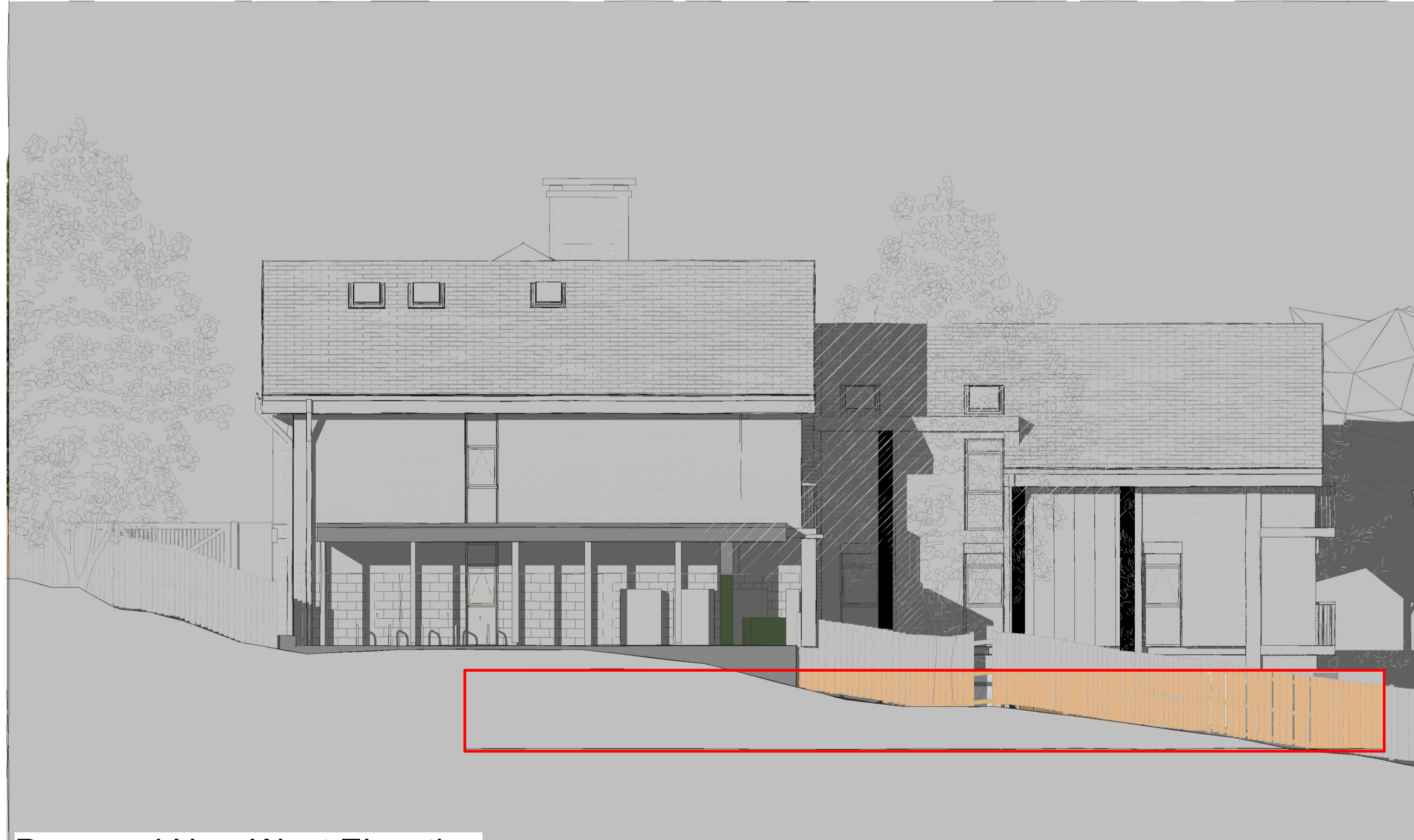
Proposed New West Elevation 1 : 100