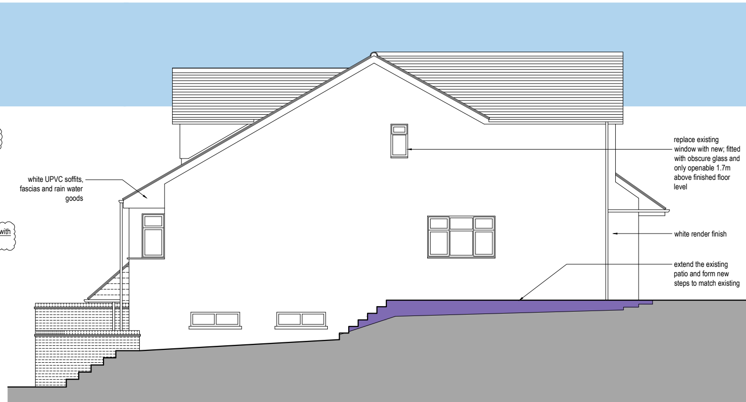
SIDE ELEVATION south east