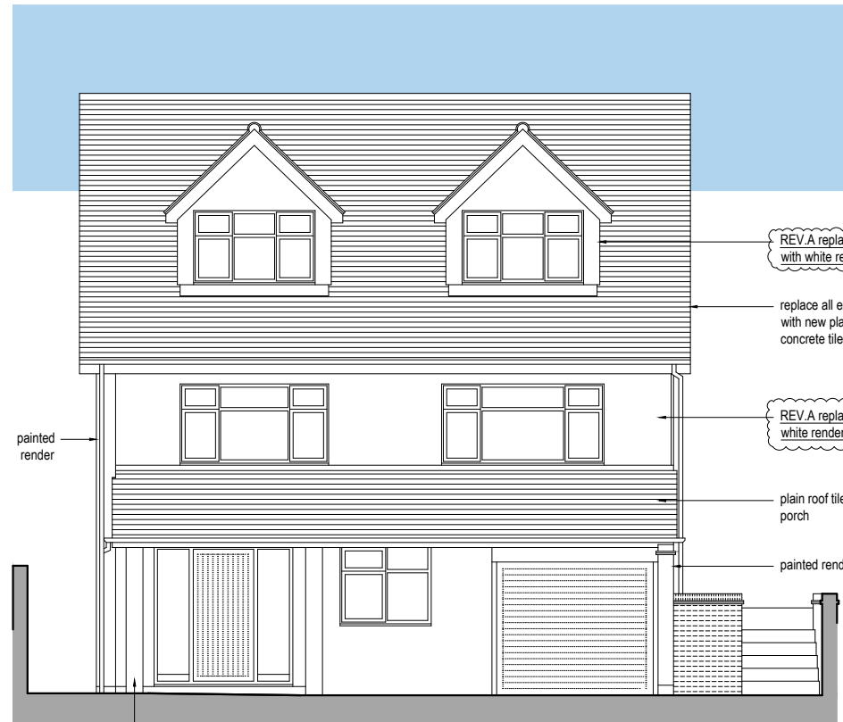
FRONT ELEVATION south west