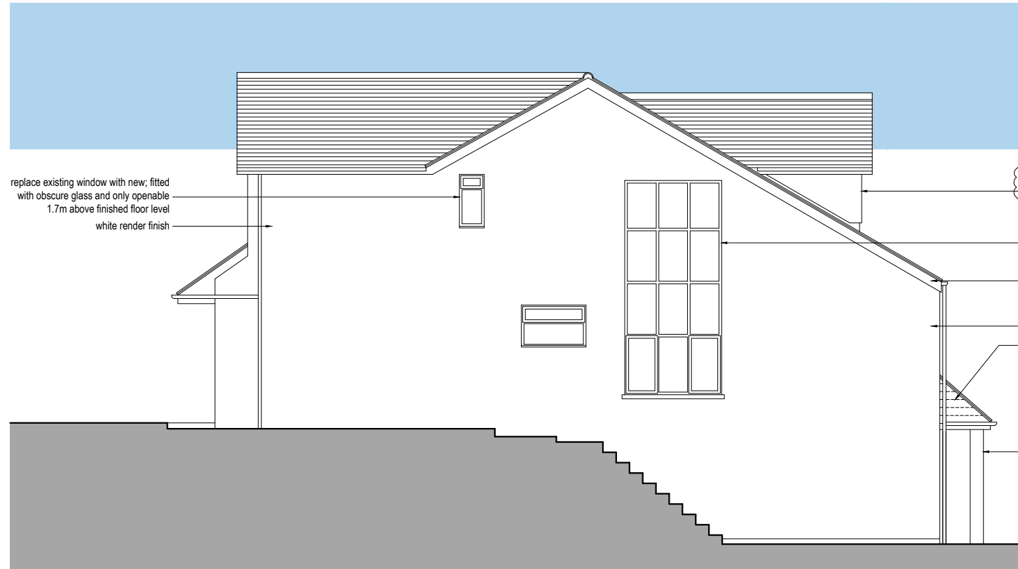
SIDE ELEVATION north west