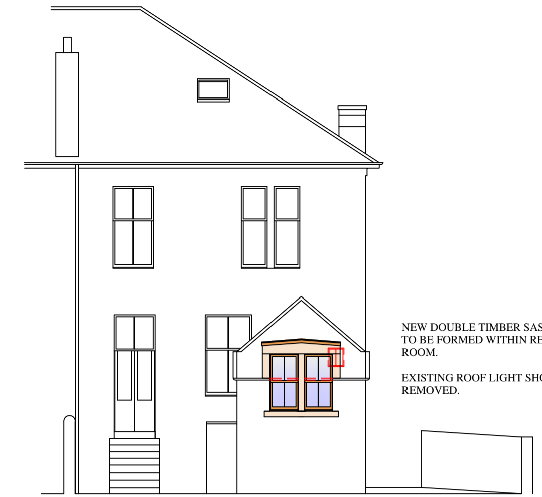
REAR ELEVATION Scale 1 : 100

NEW DOUBLE TIMBER SASH AND CASE WINDOWS TO BE FORMED WITHIN REAR WALL OF NEW UTILITY ROOM. EXISTING ROOF LIGHT SHOWN DOTTED TO BE REMOVED.