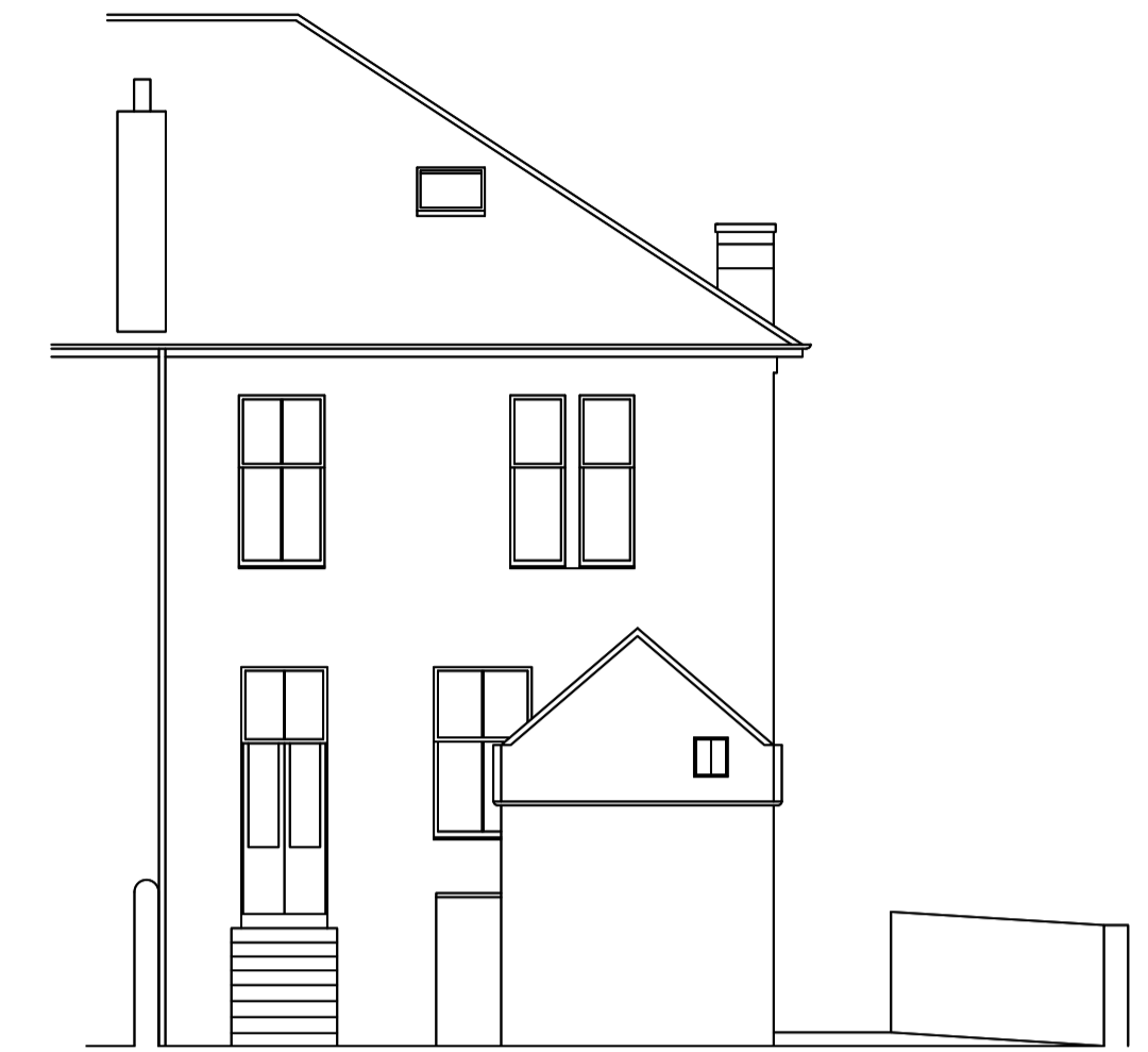
REAR ELEVATION Scale 1 : 100