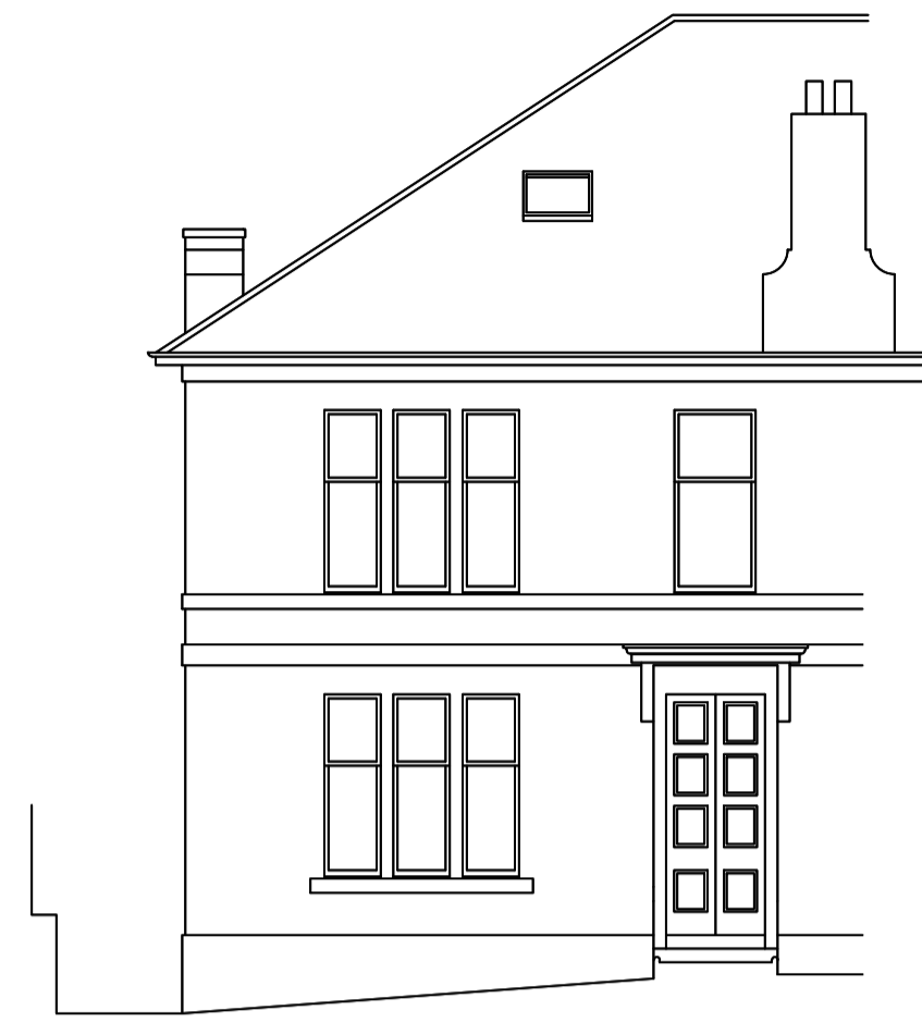
FRONT ELEVATION Scale 1 : 100