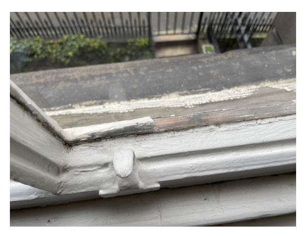
Defective sections of timbers require to be replaced.