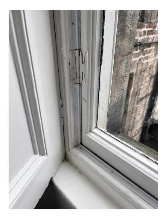
Defective easy clean battens and ironmongery requires replacement.