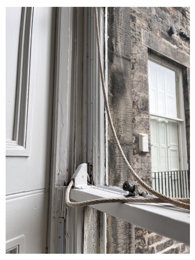
Defective rope cords do not allow for ease of opening for the user