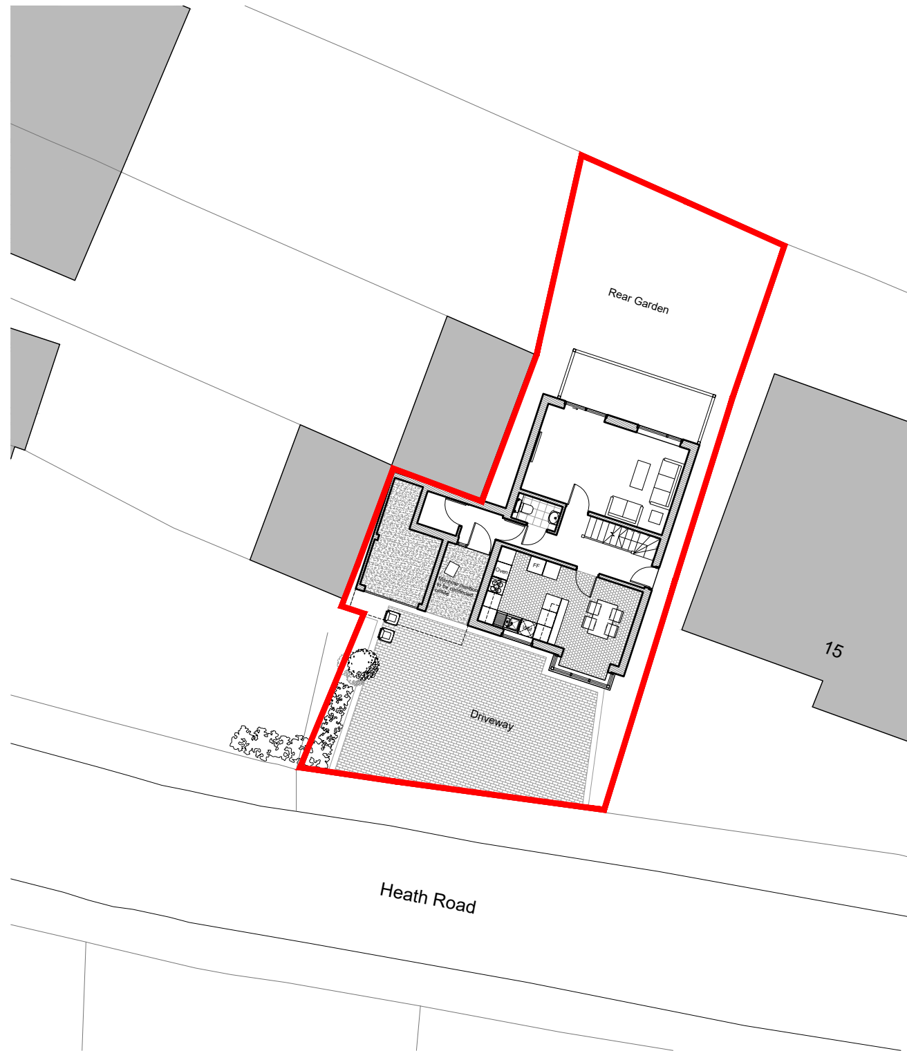
Existing Ground Floor Block Plan