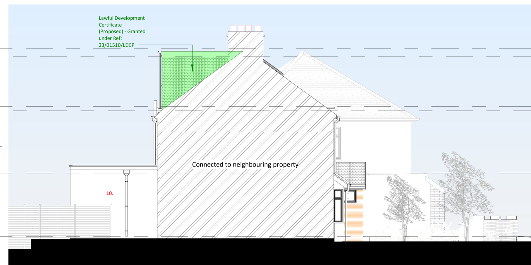
2 Proposed Left Elevation 1 : 100