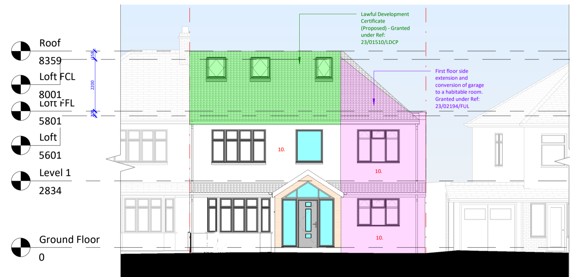
1 Proposed Front Elevation 1 : 100