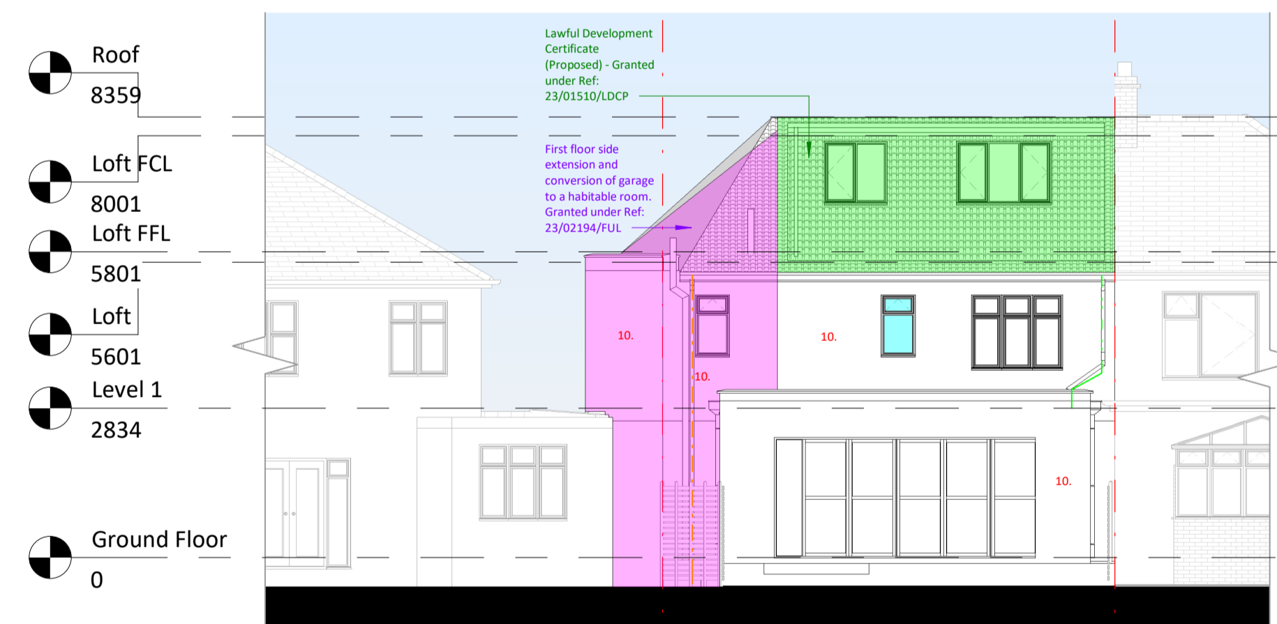
3 Proposed Rear Elevation 1 : 100