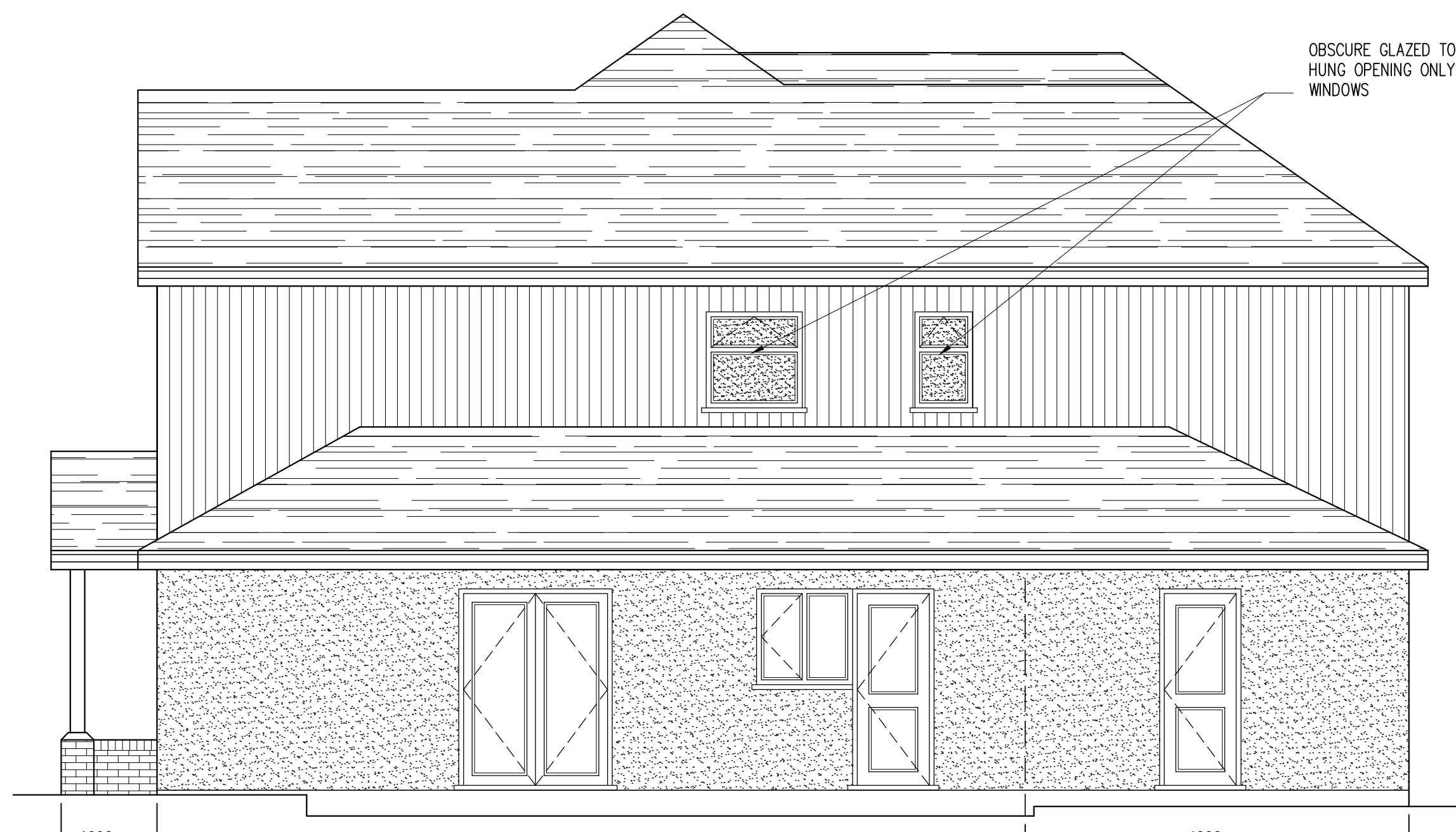
PROPOSED SIDE ELEVATION B SCALE 1:50