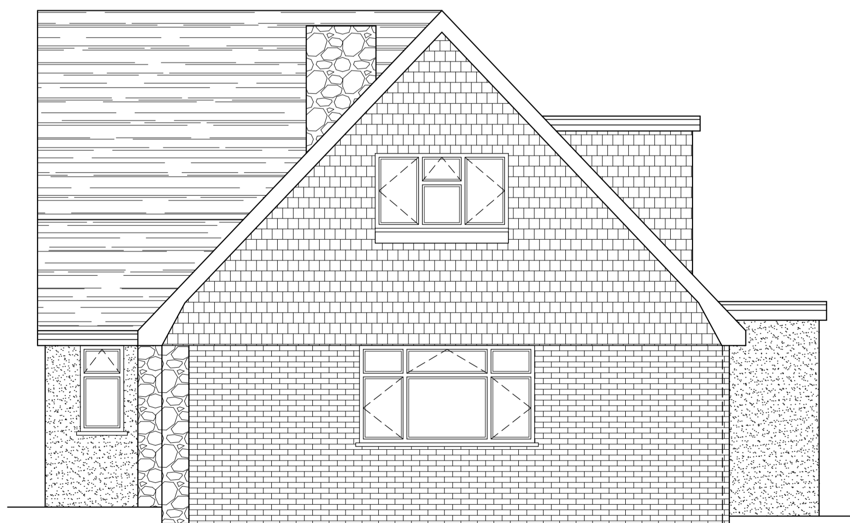
EXISTING SIDE ELEVATION B SCALE 1:50