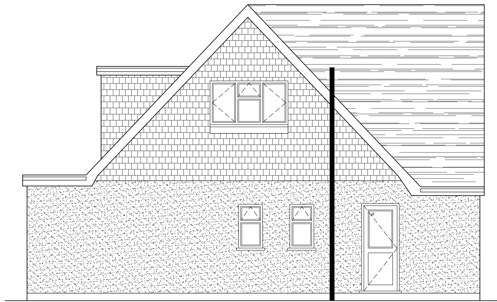
EXISTING SIDE ELEVATION A SCALE 1:50