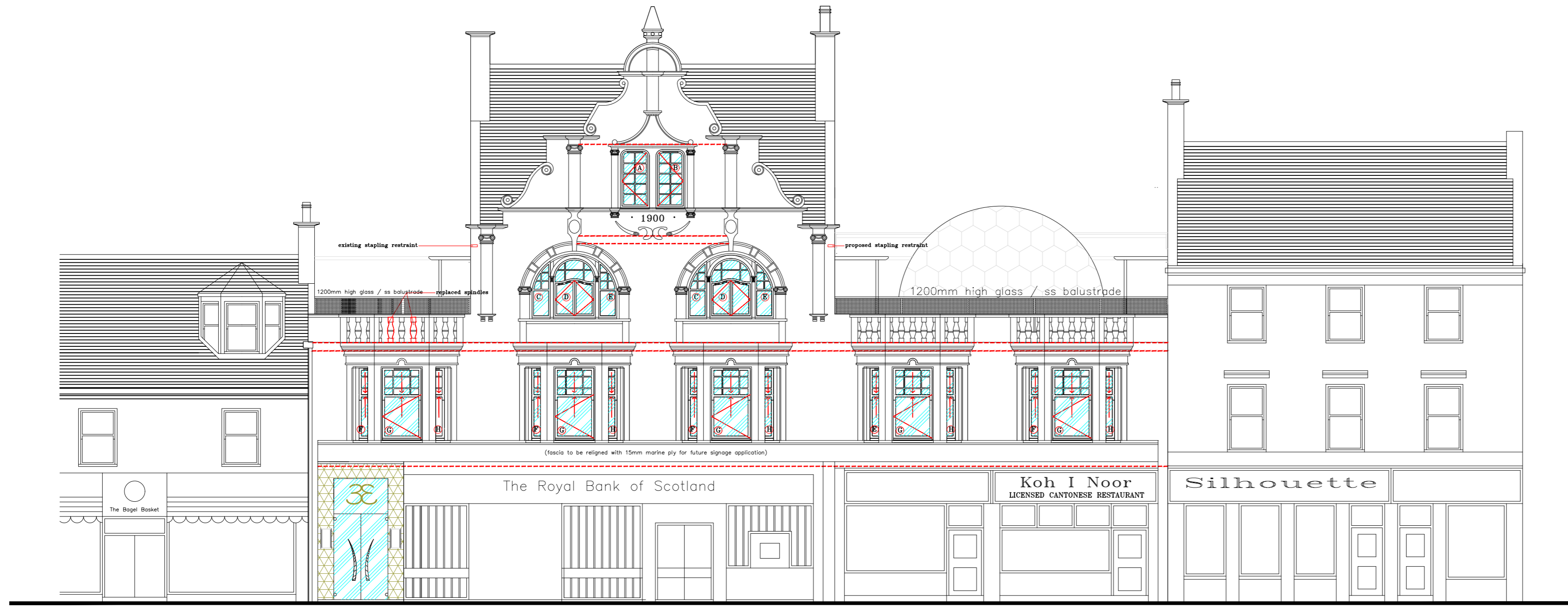
FRONT ELEVATION – AS PROPOSED