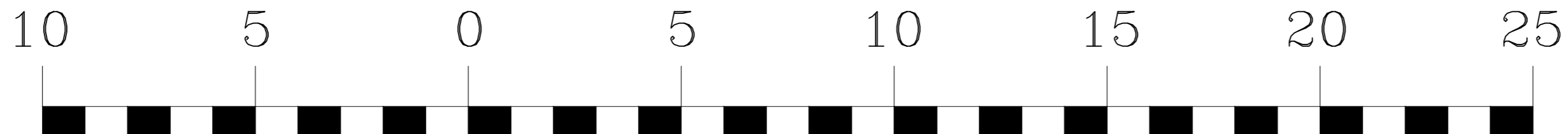
SCALE IN METRES

Oxidised Copper Tiles Pewter Finish Handles