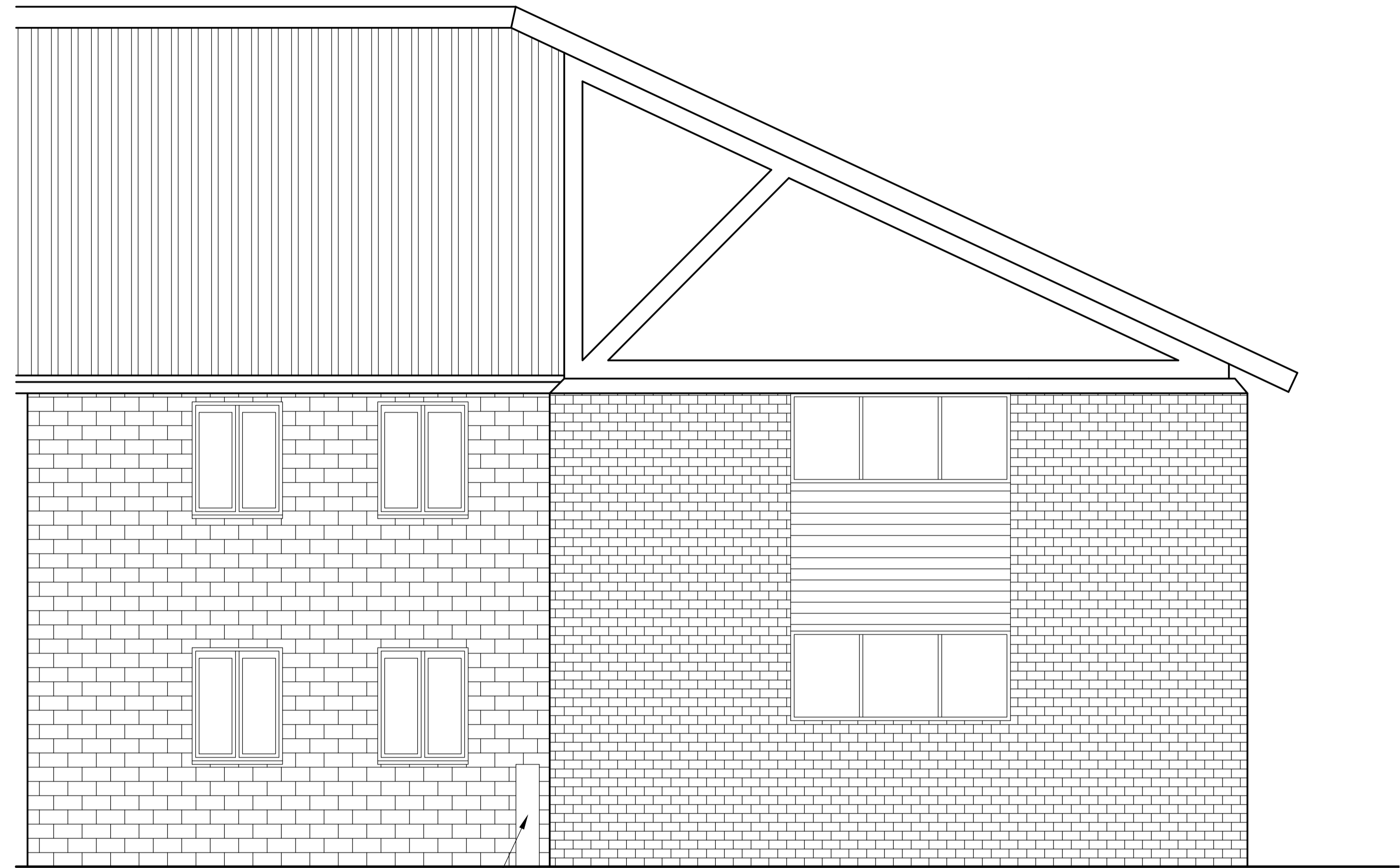
EXISTING CONDENSER UNIT