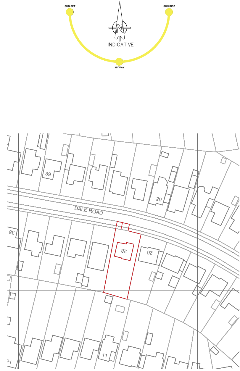
Location Plan -SCALE 1:1250