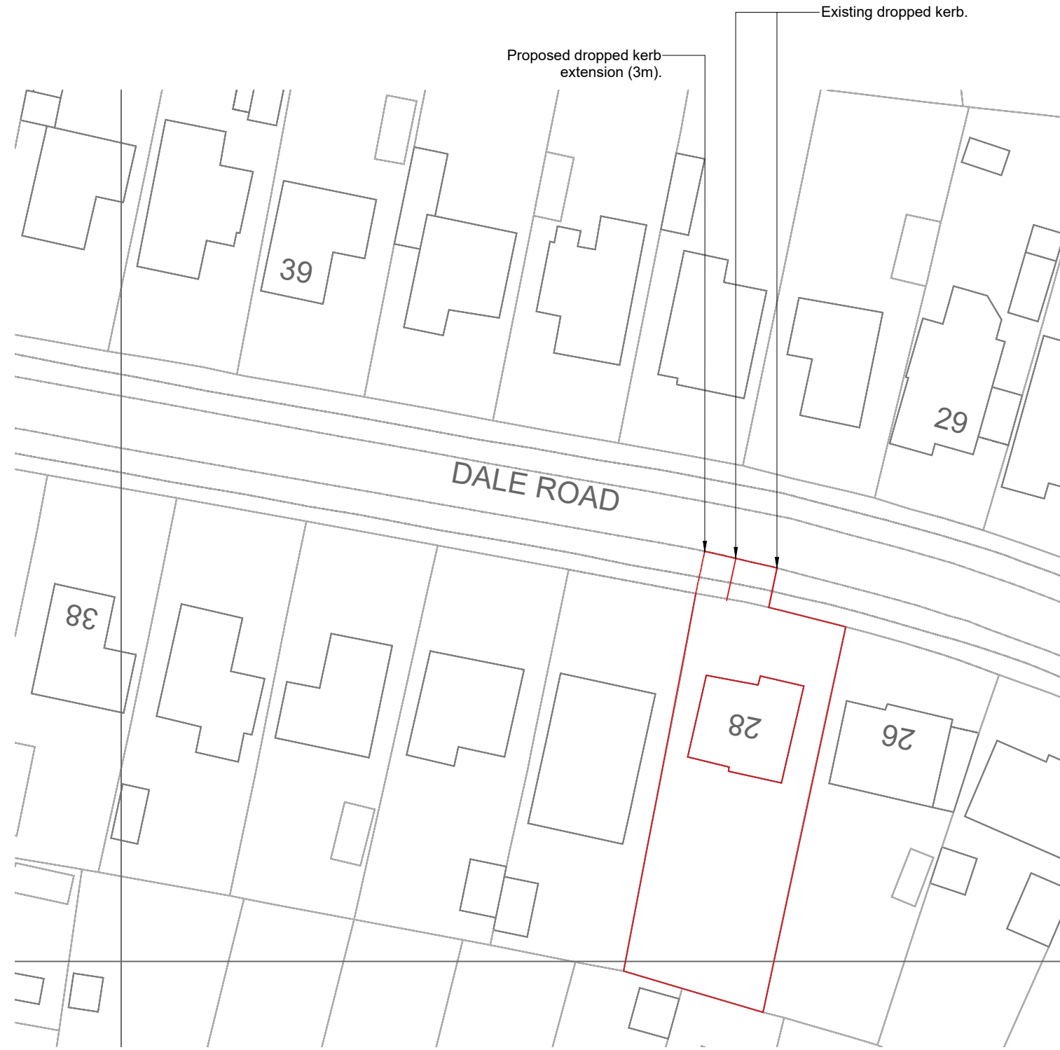
Block Plan -SCALE 1:500

copyright: this drawing is the copyright of MARCHitecture Architectural Design and may not be reproduced without their permission in writing note: it is the contractors responsibility to check all dimensions and levels on site and report all discrepancies immediately to the architect the contractor should not scale off the drawings under any circumstance.