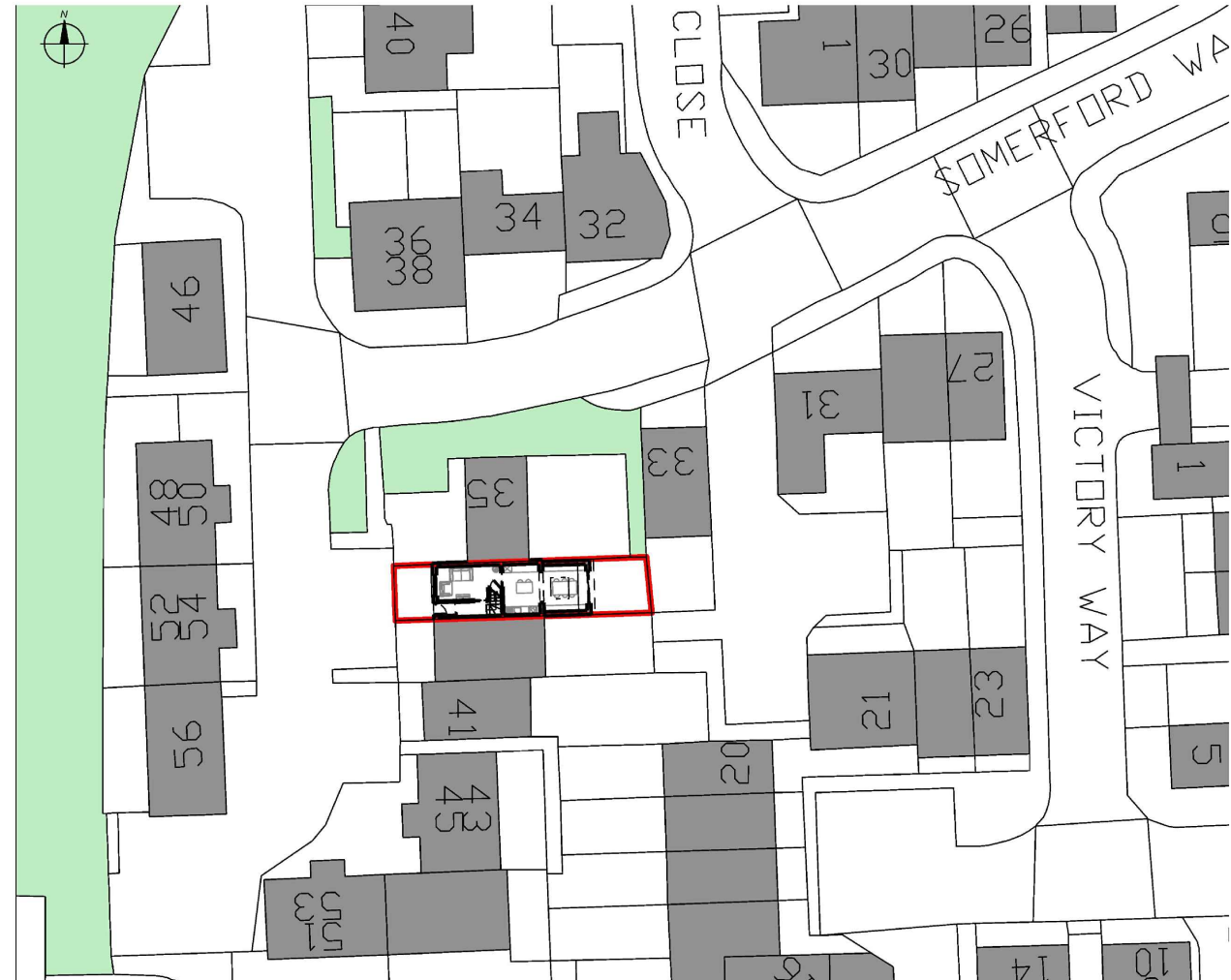
02 Location scale 1:500 @ A3