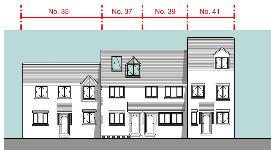
03 Front Context Elevation scale 1:200 @ A3