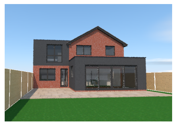
2 Proposed 3D view at rear For illustration purpose only