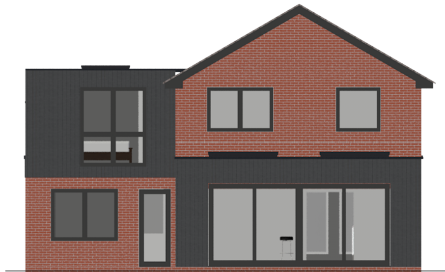
7 Rear (SW) Elevation proposed Scale: 1:100