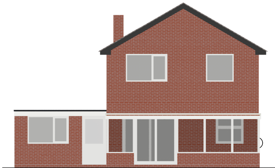
5 Rear (SW) Elevation existing Scale: 1:100