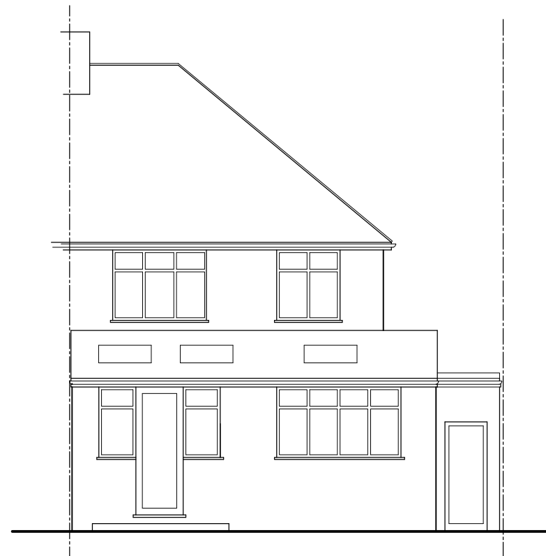
Rear Elevation [proposed]