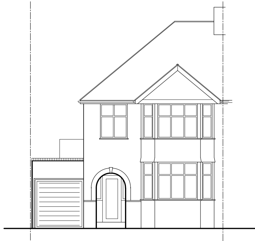
Front Elevation [proposed]