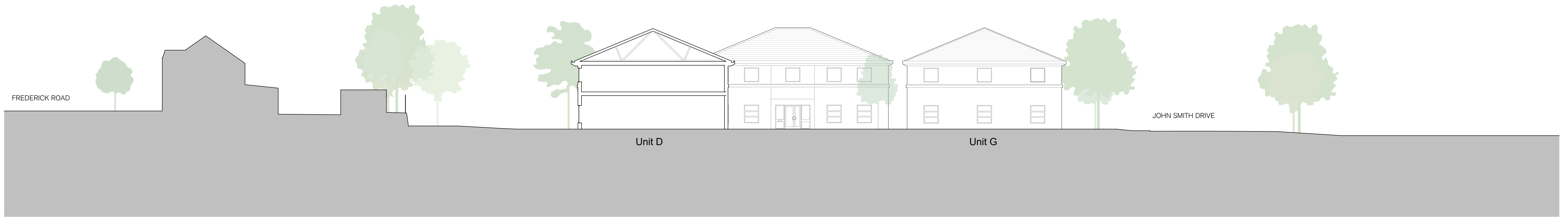
B Existing Short Section B-B 1 : 200

All architectural drawings should be read in conjunction with reports by other consultants submitted along with the application. All proposed internal layouts are indicative and approximate. Any dimensions or datum levels are subject to further detail design development. Existing Nash Court Buildings A-G are proposed for demolition, with material re-use for site levelling where possible. Further information can be found in the S&P Design and Access Statement under the 'Existing Buildings Assessment' section.