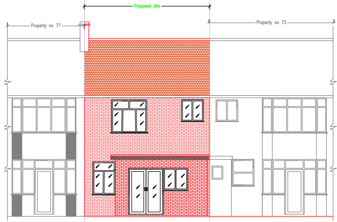
Proposed Rear elevation South-west 1:100

NOTES Drawing issued for Planning purposes only not to be used for construction. Drawing based on survey information all Levels & dimensions to be checked prior to commencing work. DISCLAIMER 1. The designer and Planner drawings are not to be used for construction unless marked "for construction". The contractor to be responsible for all levels & dimensions, which should be established & verified prior to commencing work. 2. All windows and door manufacturer/installer to check deflection of supporting structure designed by SE is compatible with window head installation detail prior to construction. 3. Any discrepancy with information shown on any drawing to be reported to the designer immediately. 4. The contractor shall be responsible for serving upon the local authority any required commencement notice & any other notice required during the process of site work. 5. The contractor shall be responsible for compliance with the building Act1984; the current building reg. all relevant British Standards or equivalent. EEC standards and codes of practice referred to therein. 6. The party wall act1996 must also be observed as appropriate. 7. All materials & workmanship to be in accordance with relevant British standards, code of practice including BS8000:1989-workmanship on building sites. 8. All proprietary products & systems to be used in strict accordance with manufacturer instruction.