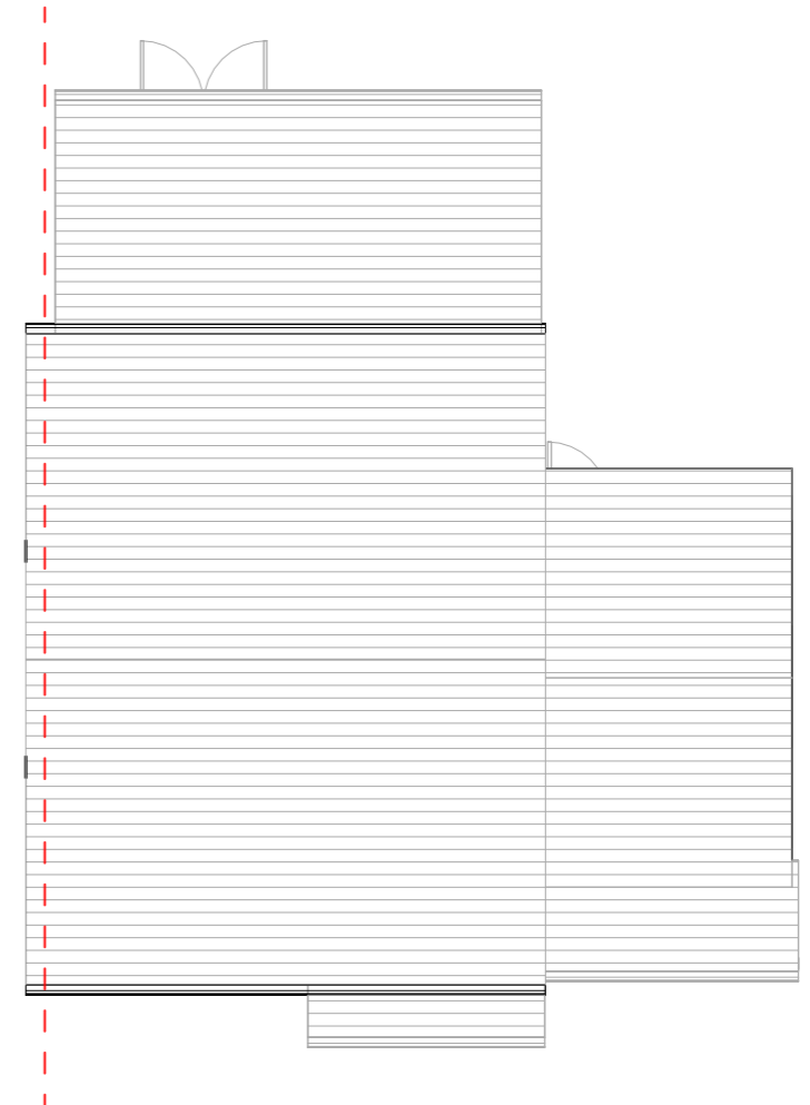
EXISTING ROOF PLAN