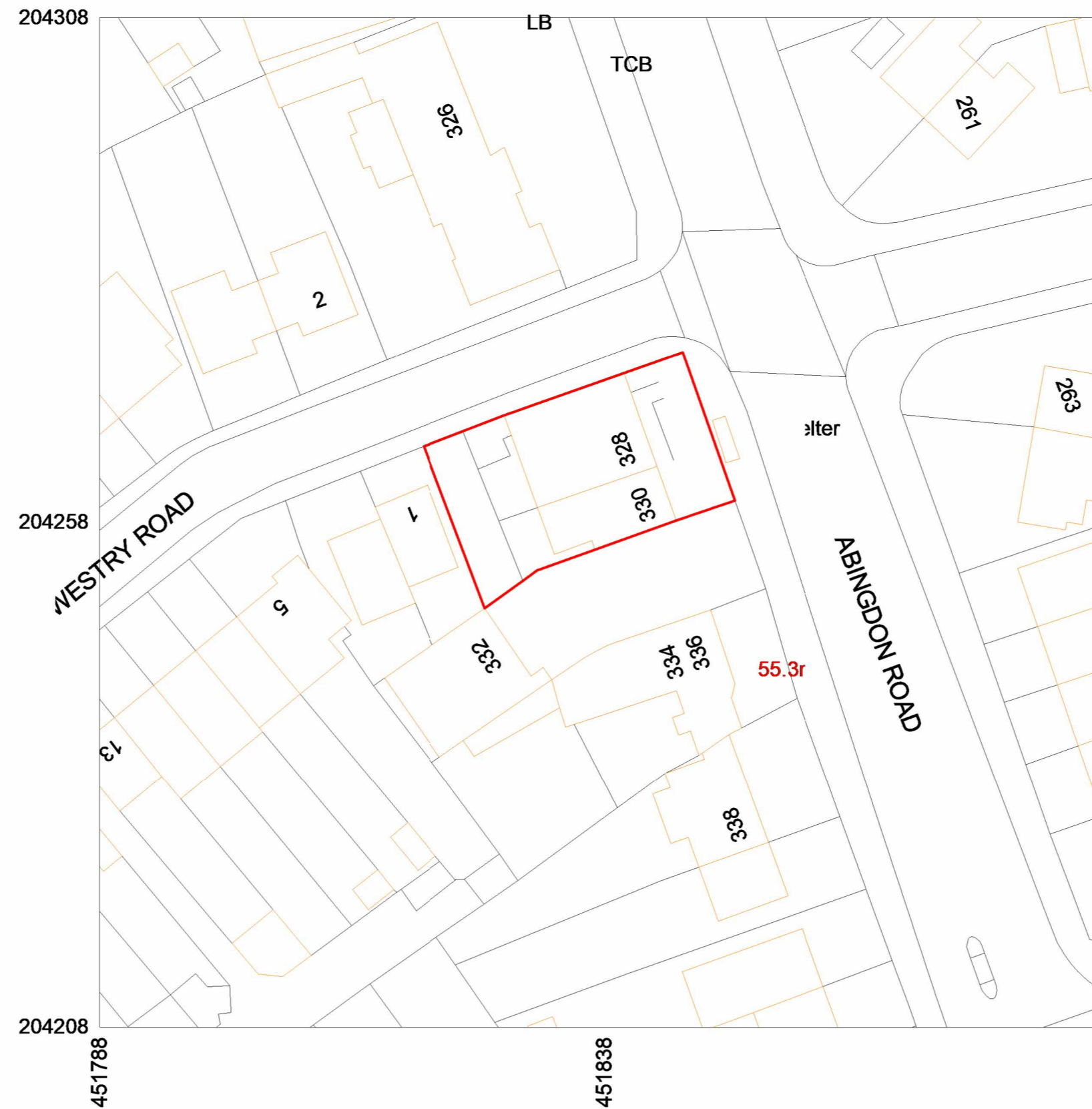
2 S-Block Plan - Existing 1 : 500