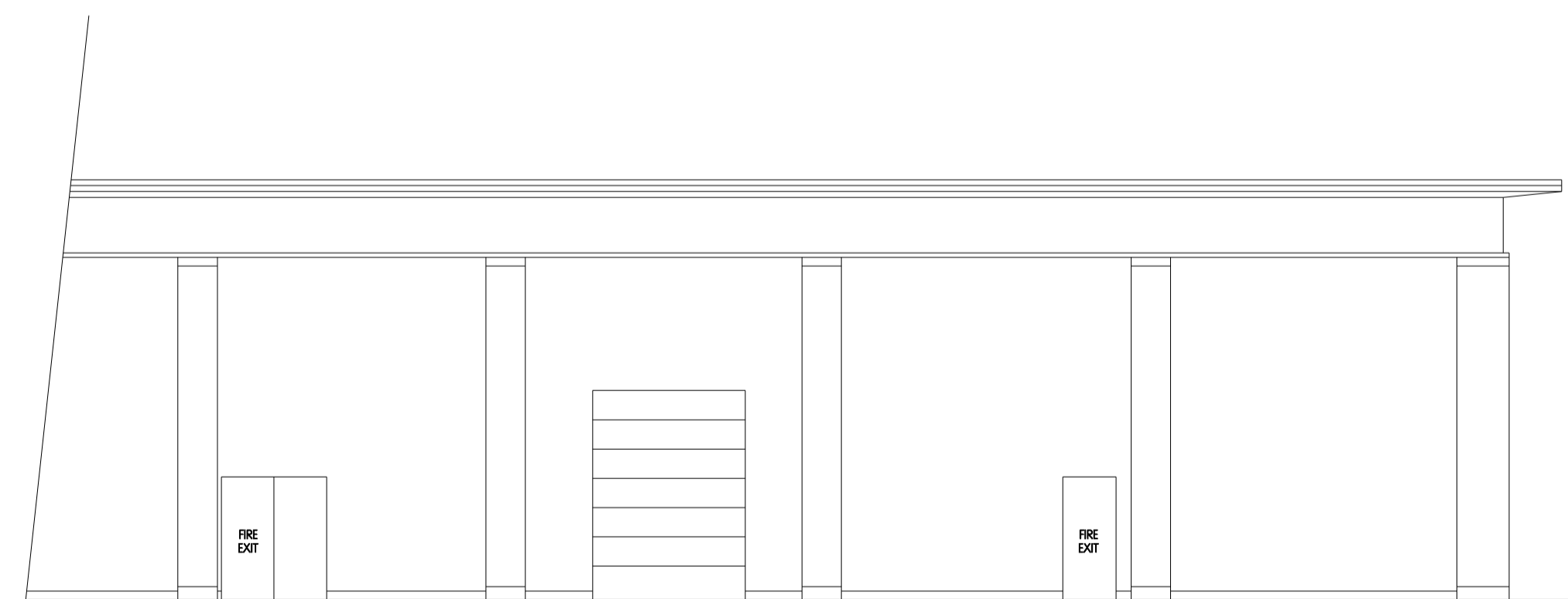
PROPOSED REAR ELEVATION - 1:100

ALL DIMENSIONS TO BE CHECKED ON SITE. WRITTEN DIMENSION TO BE TAKEN IN PREFERENCE TO SCALED. COPYRIGHT © 2015. Except where otherwise stated all rights, including copyright, in the content of these drawings and designs belong to NWD Architects Ltd. You are not permitted to copy, digitise, adapt or change these materials without the prior written permission of NWD Architects Ltd.