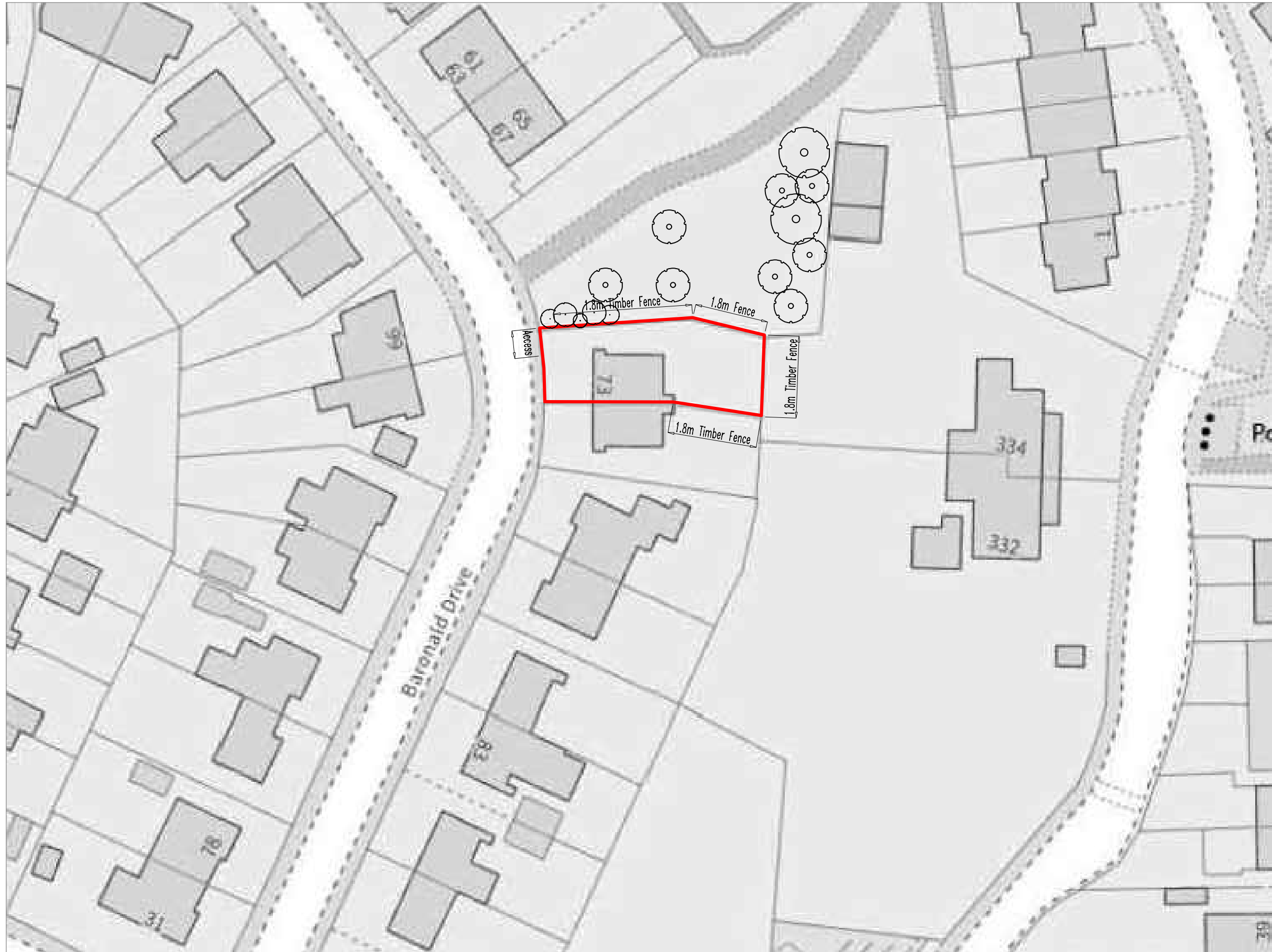
BLOCK PLAN AS EXISTING 1:500