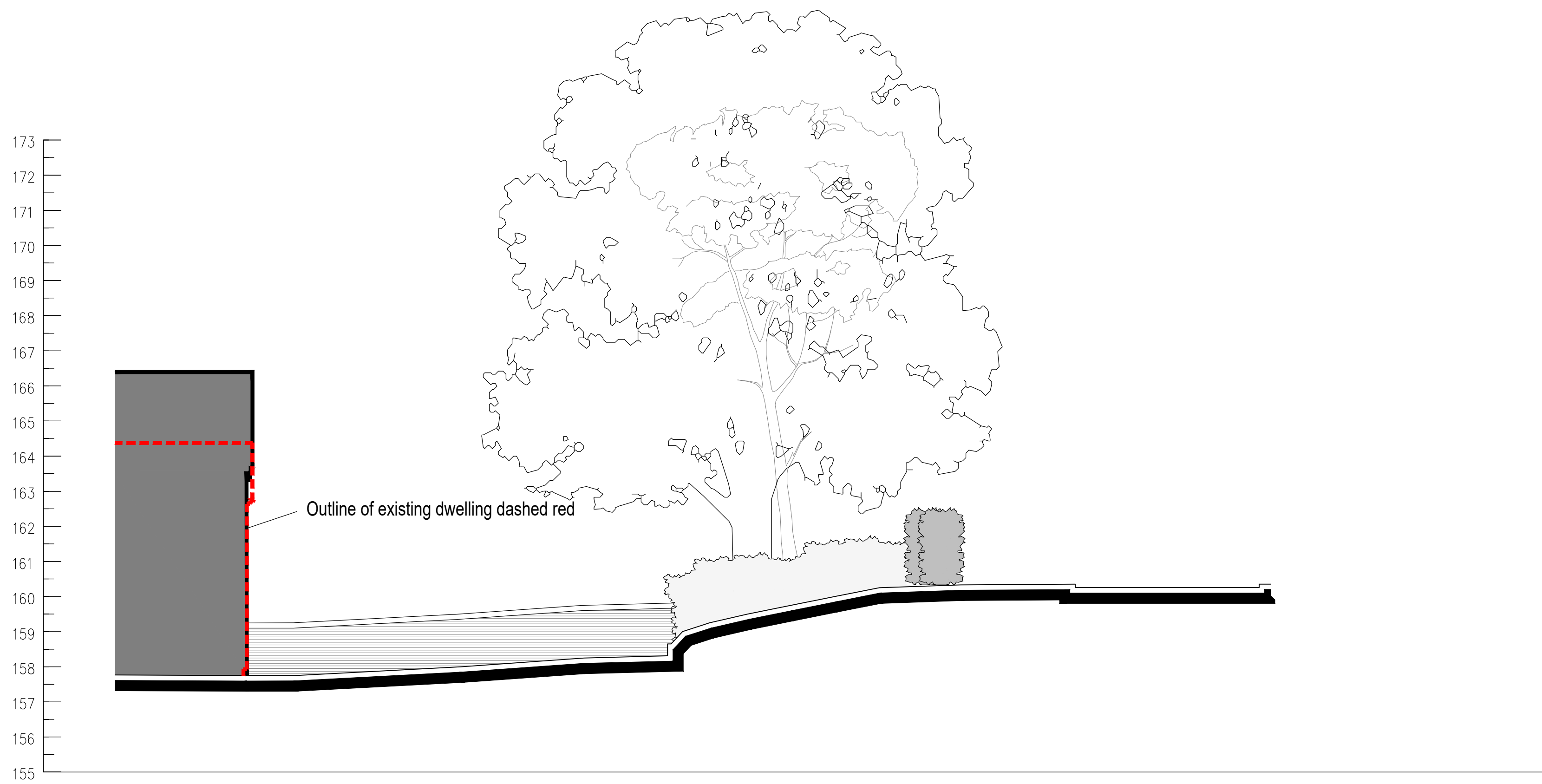
EXISTING SITE SECTION A-A SCALE 1:100