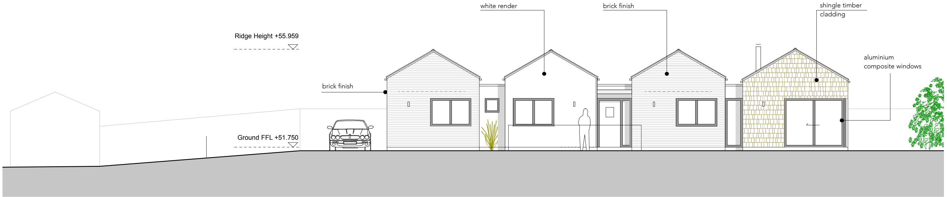
PROPOSED SOUTH-WEST ELEVATION