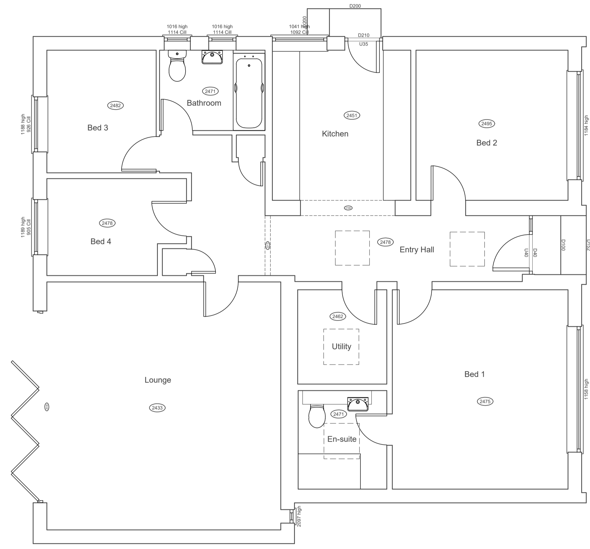
Ground Floor Existing

Note: Refer any discrepancies to Pivotal Architectural Services immediately. All dimensions are to be verified on site prior to any work commencing. © Copyright Pivotal Architectural Services