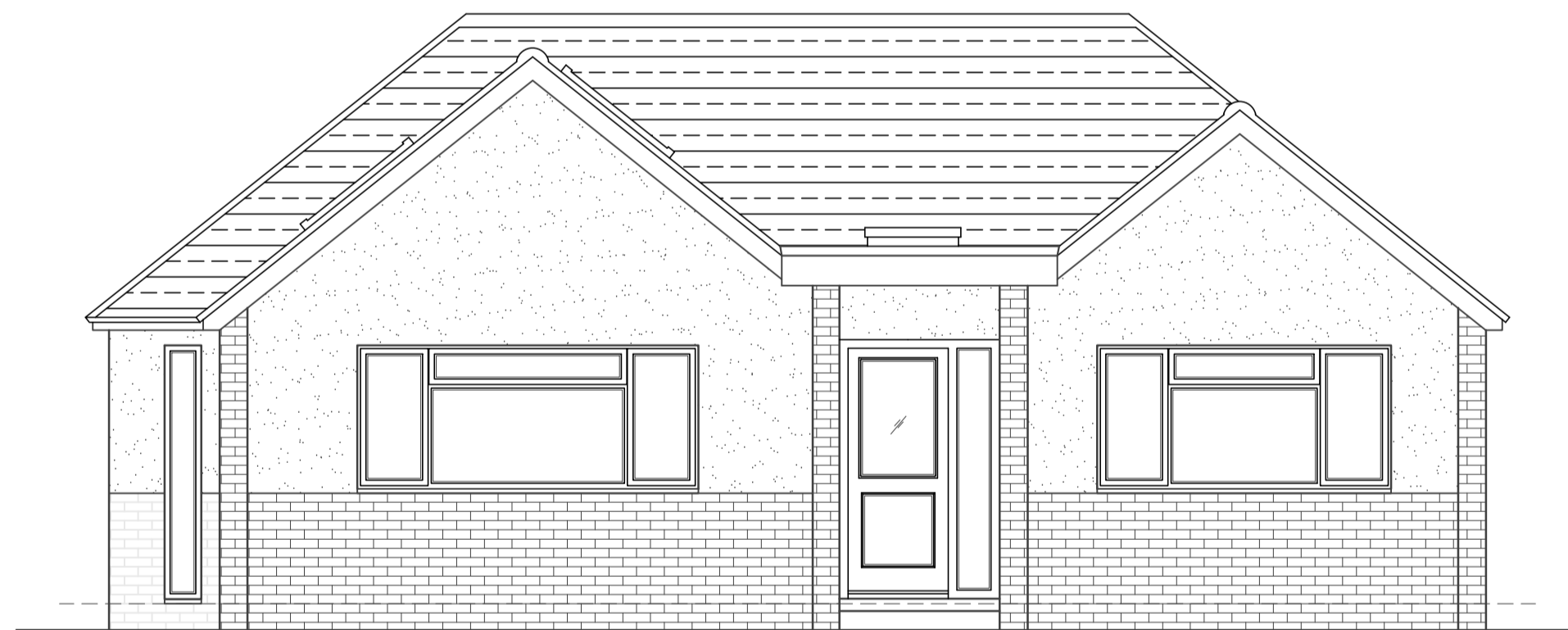
Front Elevation Existing