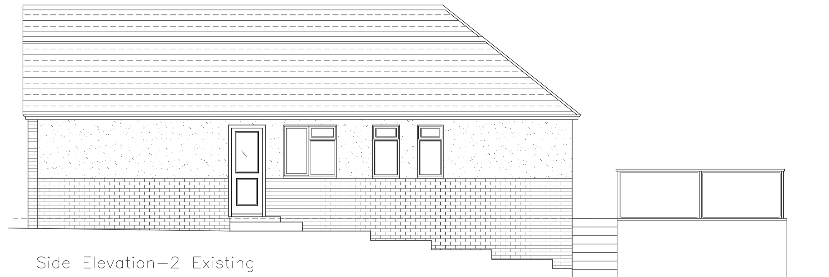
Side Elevation-2 Existing