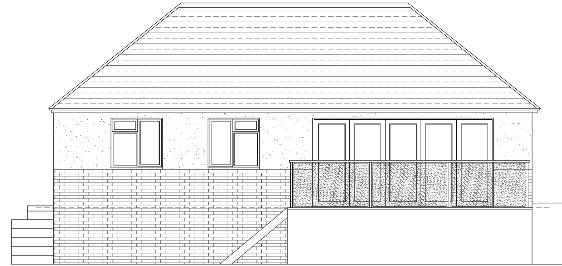
Rear Elevation Existing