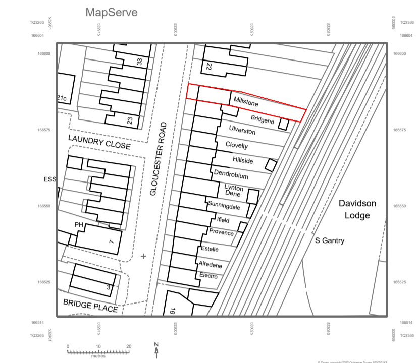
Site Location Plan 1:1250 @A1