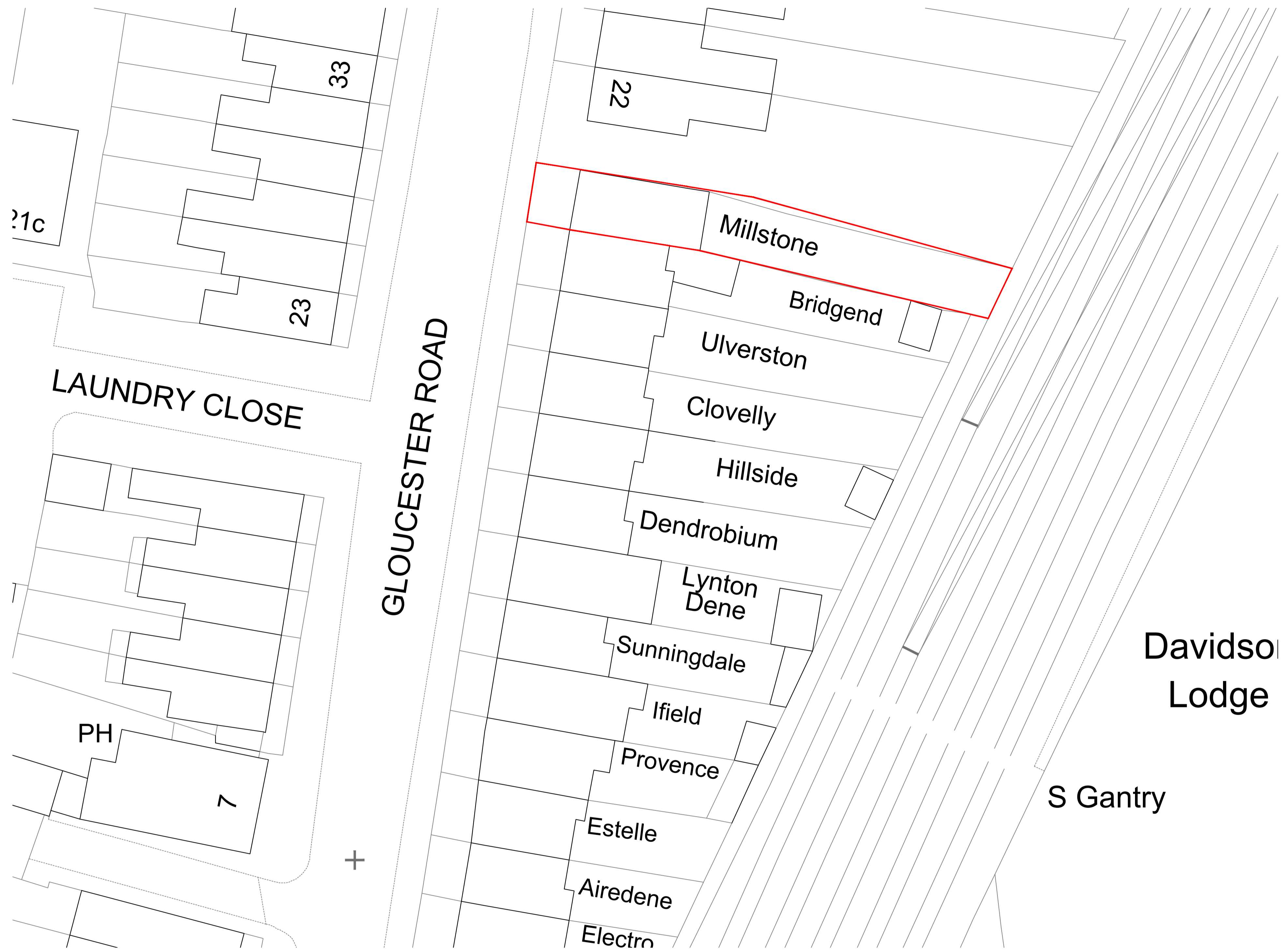
Block Plan - 1:200 @A1

Block Plan & Location plan from site survey