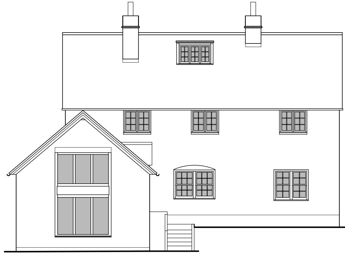
Existing North Elevation 1:100