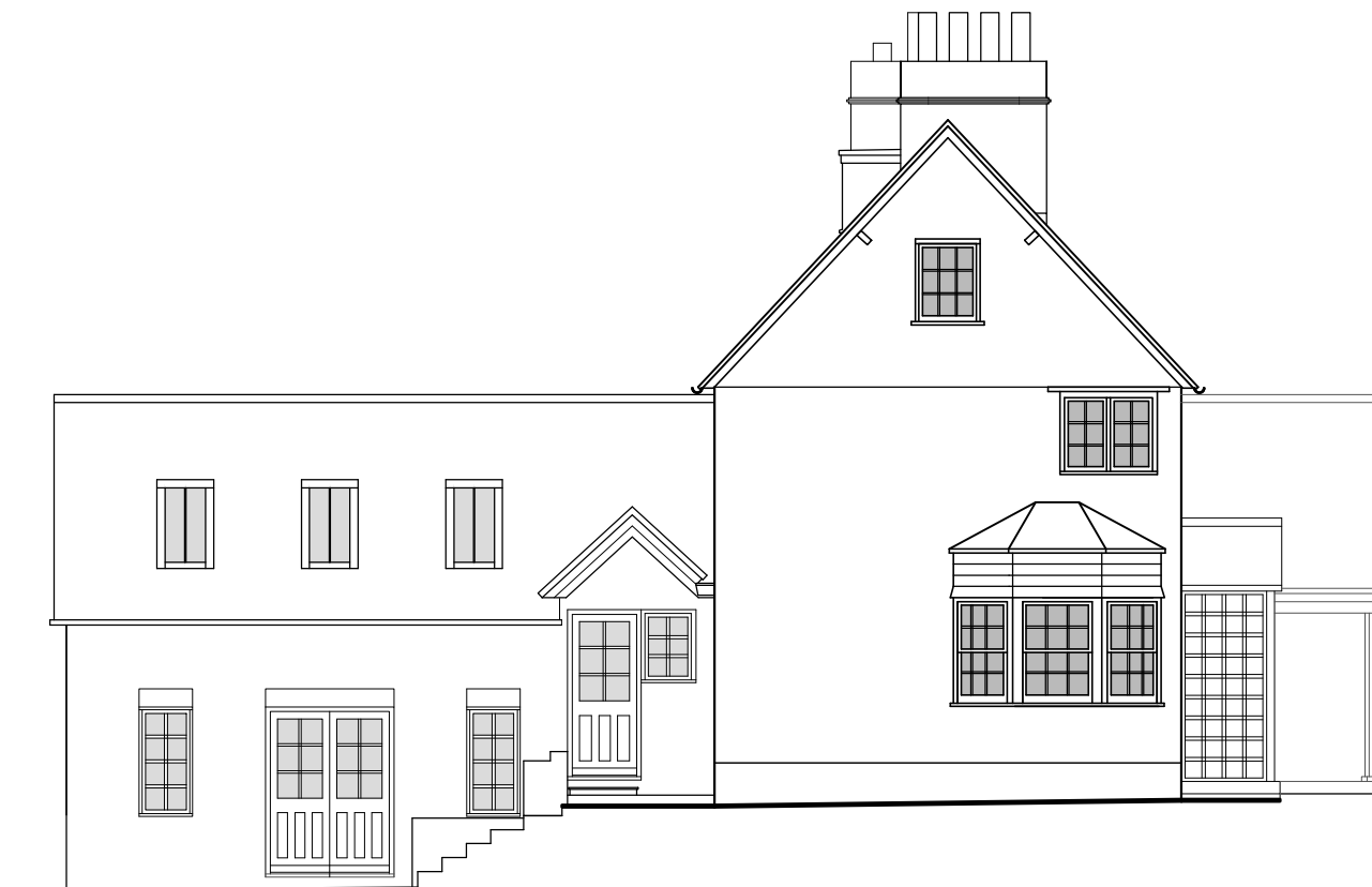
Existing West Elevation 1:100