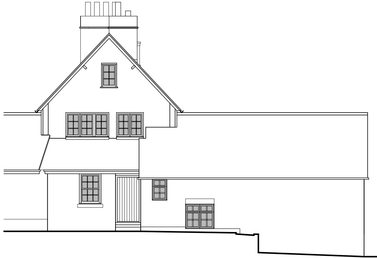
Existing East Elevation 1:100