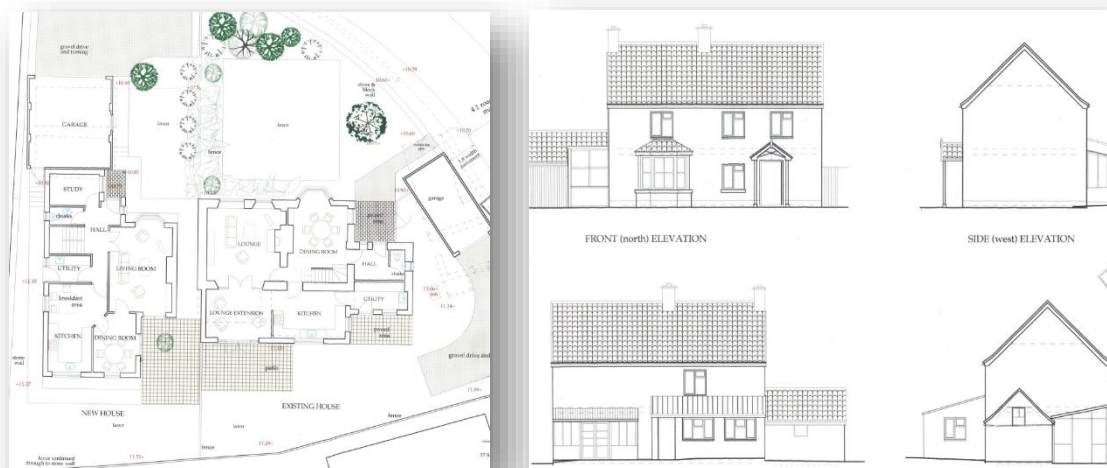
Lef: Site plan showing the proposed new dwelling in the 2004 application (now built).

Architecturally, the house is traditional in character with a pitched roof over two storeys and a simple in form.