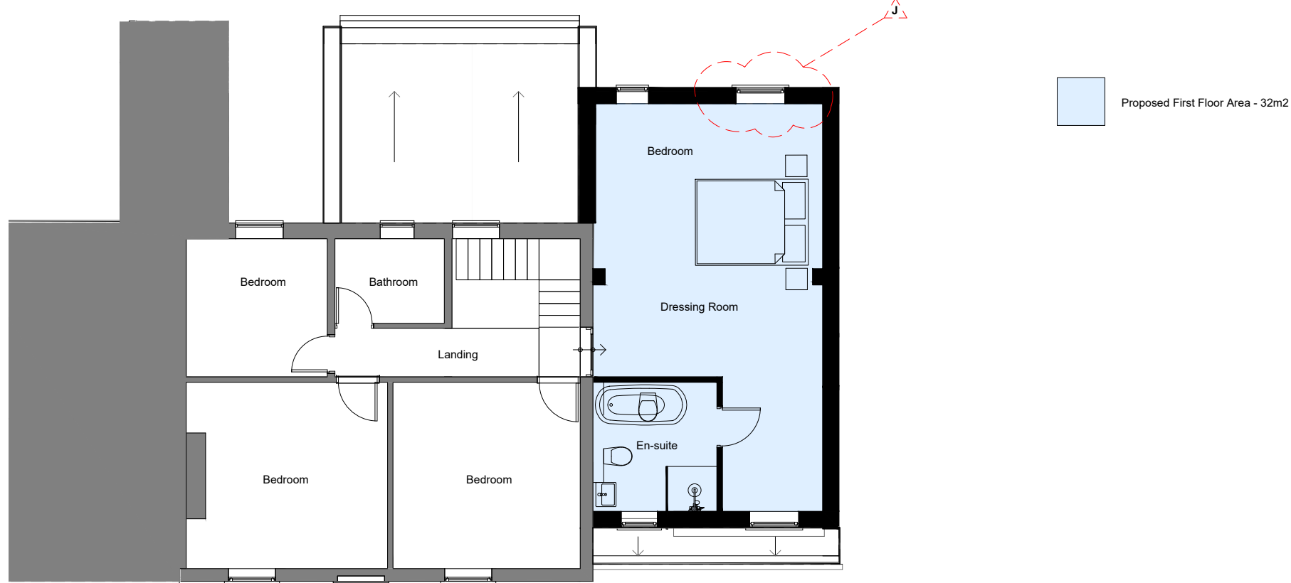
PROPOSED FIRST FLOOR PLAN - 1:100