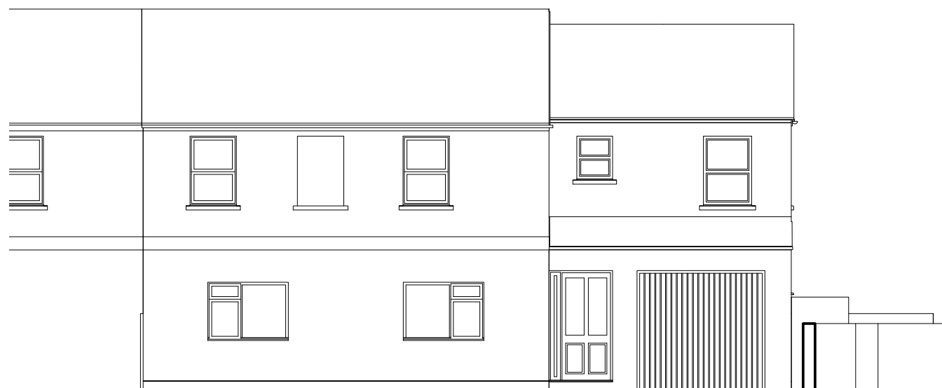
PROPOSED SOUTH EAST ELEVATION - 1:100