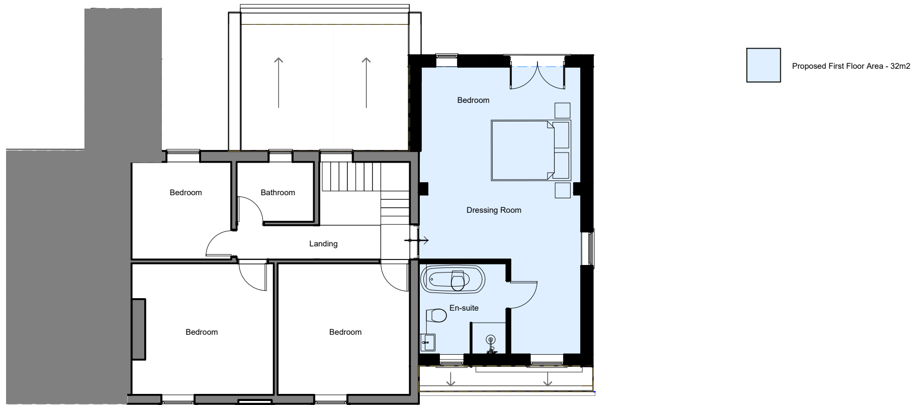
PROPOSED FIRST FLOOR PLAN - 1:100