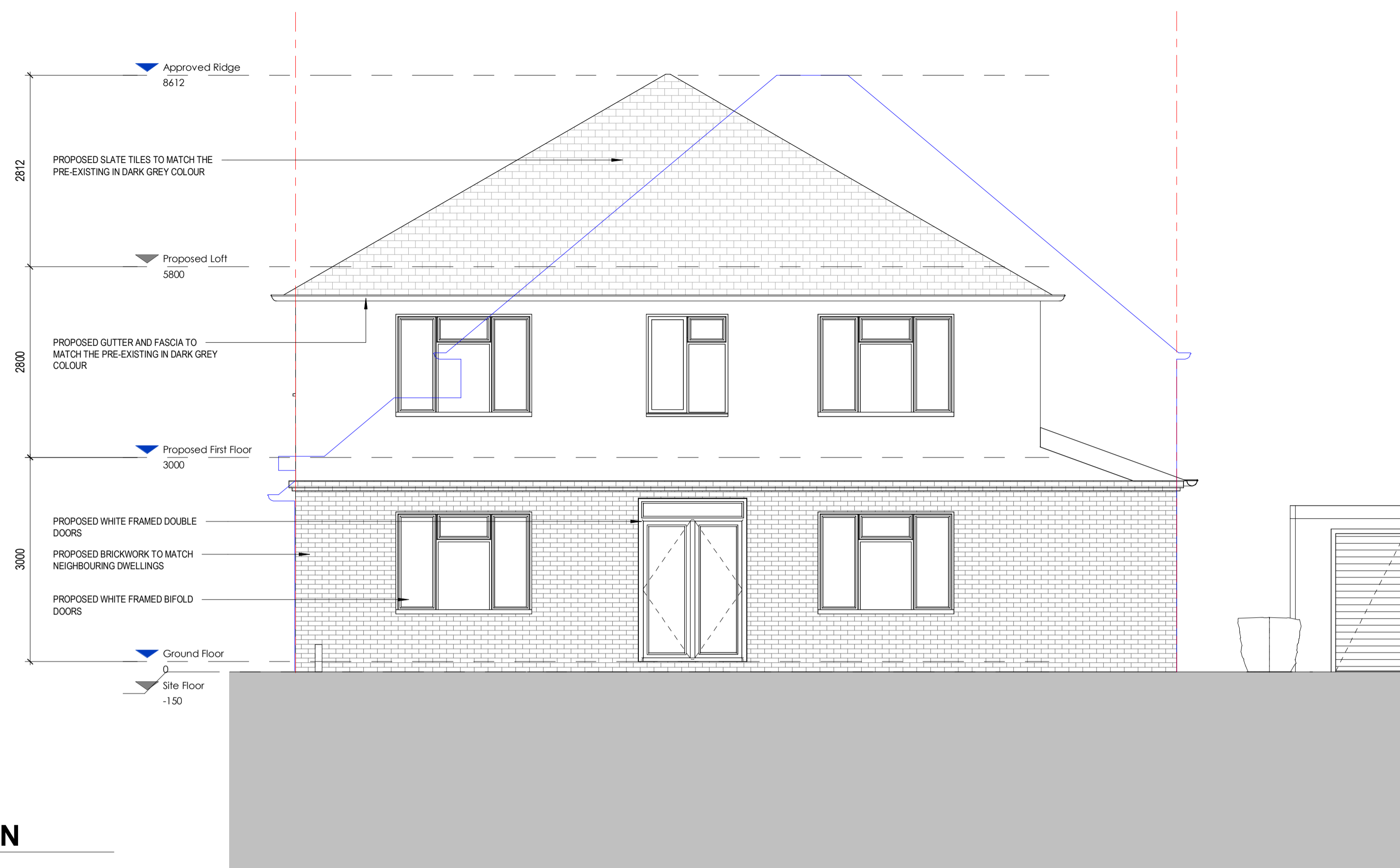
1. PROPOSED FRONT ELEVATION 1 : 50

APPROVED OUTLINE FOR 22/1208/PDT The construction of one additional storey (2.622m in height) and raising of ridge to result in an overall height of 8.61m (Class AA)