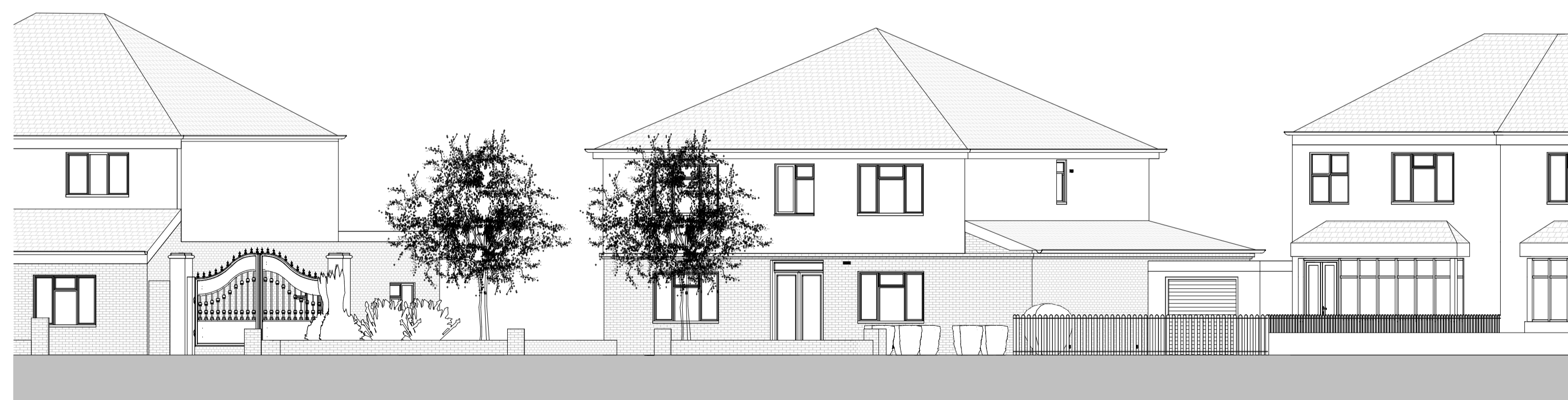
2 PROPOSED STREET SCENE 1 : 100