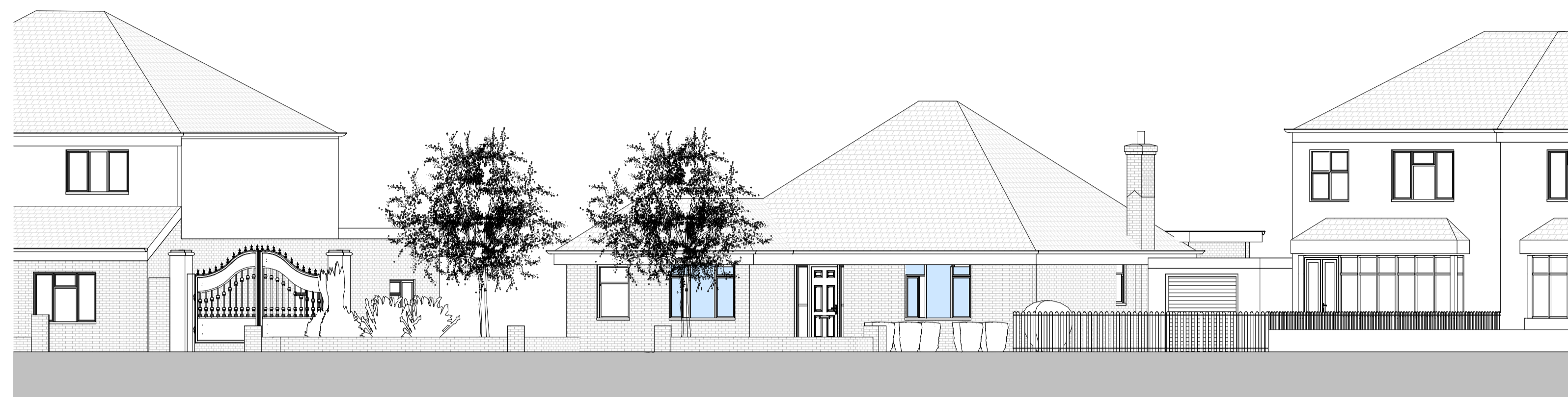
1 EXISTING STREET SCENE 1 : 100